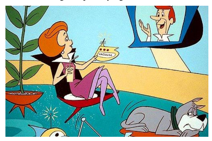
Picture 6. Jane Jetson Video Talking with George Jetson

Video Phone was an important and frequently used item in The Jetsons. Video/Smart Phones, that are a result of the innovations in communications technologies and very popular in our world today, were visualizing and prettifying communication in the Jetsons.