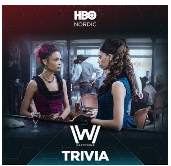
Picture 3. Maeve and Clementine (HBO Nordic Official Instagram Account)

Maeve: Haven't you thought about whether this is the life you want..?