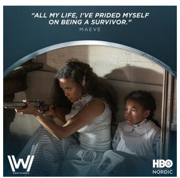
Picture 2. Maeve and the Girl She Has in a Different Life

The constantly updating of the hosts as different characters also confuses their minds. For example, when Maeve, a bar owner in the show, says, "What is happening to me? I am living a different life with a little girl for a moment, I can see her, feel her hair in my hand, and her breath in my face. Then I'm in Sweatwater again. Which one is real I can't tell apart." She was actually recalling an event in her previous character - the mother and girl escaping from a killer (See Picture 2).