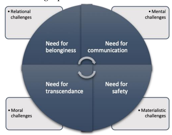
Figure 2: The Dynamic of Spirituality in the Context of Urban Life Human beings spiritual desire for connectedness

At this junction, the recognition that society's health and urban planning relays a co-dependent dynamic (Killingsworth and Schmid, 2001), our understanding of health expands to include spirituality in the context of connectedness, we challenge to consider its convergence with planning sustainable and prosperous cities for future. Here we offer a bottom-up model to understand spirituality in the context of urban dwellers' connectedness need, challenges and expectations, as depicted in Figure 2.