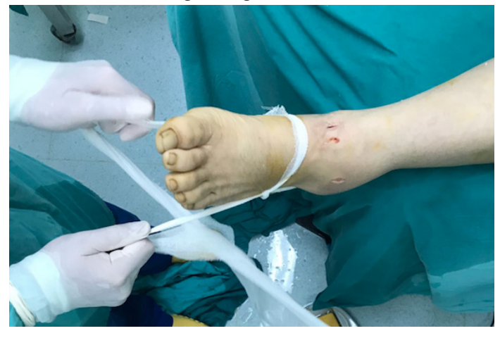
Figure 8: Anterior visualization of the ankle after slipping the 2 loops on the ankle and ensuring their tightness