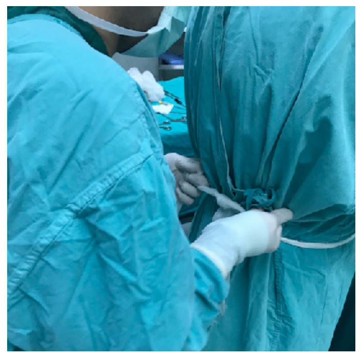
Figure 9: Tying the two free ends of the bandage behind the primary surgeon