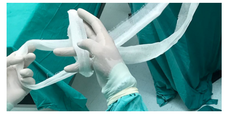
Figure 5: Two loops formed