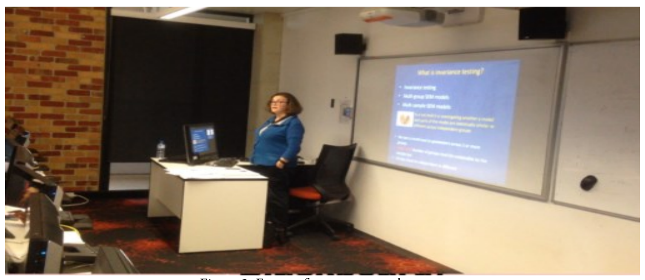
Figure 2. Face-to-face on campus lecture

On-campus face-to-face classes are offered for all postgraduate units at the Swinburne Hawthorn Campus in Melbourne for those students who can attend (see Figure 2 below). These sessions are offered in the evenings outside normal business hours. For the graduate certificate level units two day on-campus weekend workshops have been run during the study period so that all interested students could join the sessions, even those living interstate. These sessions are recorded through the Echo System and uploaded on Blackboard so that all students can watch the recorded lectures. On-campus evening classes (3 hours weekly) are offered for graduate diploma and masters level units throughout the study period. To improve the level of industry engagement guest lecturers are used in some of the units including the masters level unit called "Statistical Consulting'. These sessions are also recorded through Lectopia/Echo360 and made available for students through Blackboard. Learning occurs in face-to-face sessions through the study period with online recordings of these sessions also available to all students.