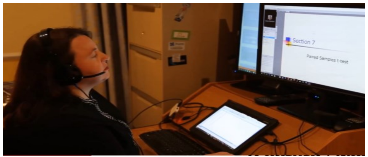
Figure 3. Blackboard Collaborate class