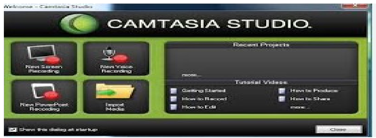
Figure 5. Camtasia studio

Camtasia is a user friendly TechSmith product which allows students to access computer generated audio visual training via online delivery. Both the screen and the voice are captured (see Figure 5 below). In some of the units a number of Camtasia recordings (audio/video) are used along with lecture recordings. These recordings are mainly used as a replacement of laboratory activities and to summarise topics included in unit content. Sometimes instruction about how to use a specific statistical tool or software are recorded in Camtasia and made available for students through Blackboard. Also in some of the recordings, responses to general queries about the unit are recorded and made available for all students through Blackboard.