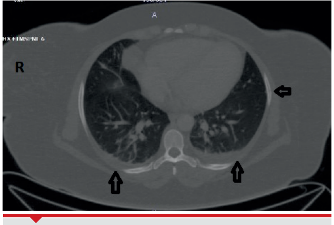
FIGURE 2. A chest computed tomography shows a left fifth rib fracture and bilateral minimal hemothorax (arrows).

Her X-ray (chest, servical and lomber vertebra, pelvis, and extremity) imaging findings were normal but a cranial computed tomography (CT) scan revealed linear fracture lines on the orbital lateral wall bilaterally (Figure 1). Contrast-enhanced abdominal CT did not reveal any traumatic pathology. In thoracic CT, fracture of the left fifth rib and bilateral minimal hemothorax were seen (Figure 2). The patient was hospitalized by the chest surgeon for treatment, including thoracic surgery and