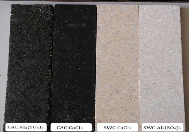
Figure 1. General view of produced CBPBs.

Density (D), water absorption (WA) and thickness swelling (TS), modulus of elasticity (MOE), modulus of rupture (MOR), internal bonding strength (IB) and screw withdrawal strength (WS) properties of the produced boards were determined according to EN 323, ASTM D1037, EN 317, EN 310, EN 319, EN 320, respectively. The test results obtained were evaluated according to EN 634-2 (2009). The data were analysed using SPSS 22 procedure for the analysis of variance (ANOVA) at 95% confident level (P \leq 0.05). Duncan test was performed to determine the difference between the groups. The general view of the CBPBs produced is given in figure 1.