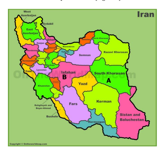
Figure 2. Map locations of doing this study, A (South Khorasan province, east of Iran) and B (Isfahan province, center of Iran) (Iranian Bureau of Statistics, 2019).

Main locations of study were rural areas in two provinces in Iran, namely Isfahan and South Khorasan provinces because of accessibility of them for author and also land fragmentation, peasantry and small holdings are more stronger and visible in them. Author utilized various documents such as Iranian and foreign scientific magazines and journals, TV and radio programs, Iranian Bureau of Statistics, discussions with experts, professors and beneficiaries and field research and visits by himself specially in above provinces. In below map, showed locations of this study as A and B. (Figure 2).