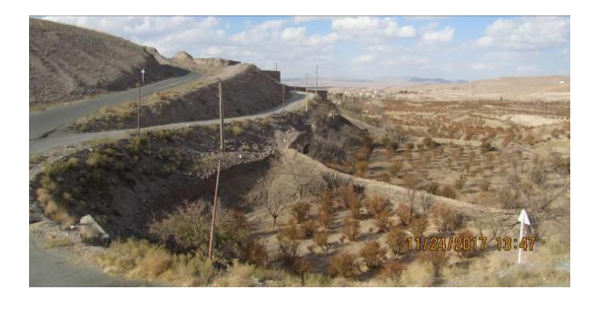
Figure 4. Land fragmentation, peasantry and small farms as major type of agricultural production system in Iran, in Barberry gardens in Robokht village in 60 km distance to Birjand, center of South Khorasan province, east of Iran. As observe, traditional and small Barberry gardens near this village, have low productivity without probability for utilizing modern technologies and mechanization etc. in them (By author. Autumn, 2017).

Land fragmentation, peasantry and small farms as major type of agricultural production system in Iran was given in Figure 3, Figure 4 and Figure 5.