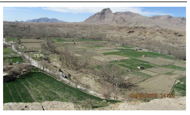
Figure 3. Land fragmentation, peasantry and small farms as major type of agricultural production system in Iran, in 60 Km distance in west of Isfahan city and beside Zayandeh Rood River in center of Iran. Traditional rice farms by utilizing high amount and volume of valuable and scarce water in this arid and semi-arid region of country without sufficient monitoring in this important and critical issue by responsible governmental organizations (By author. Spring, 2019).

There are 82845 stakeholders in agricultural sector in this province that more than 99 percent of them are small holdings or peasant land-scattered strips (with and without belonging land to farmers). Agricultural sector contribute 29 percent of total productions and 32 percent of total employment in this province. Saffron, Jujuba and Barberry are most important agricultural productions in this province. Also, there are 6254 Canats (Traditional subterranean canal for exploiting underground water) in this arid region (First rank in the country) (Iranian Bureau of Statistics, 2019). (Figures 4 and 5).