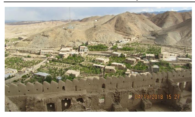
Figure 5. Land fragmentation, peasantry and small farms as major type of agricultural production system in Iran, Forg district – near borders of Afghanistan - in 100 Km distance to Birjand, center of South Khorasan province, and east of Iran. As observe, traditional and small Saffron and Barberry gardens near and inside of this village, have low productivity without probability for utilizing modern technologies and mechanization etc. in them (By author. Spring, 2018).

After gathering information following results achieved and classified as below: