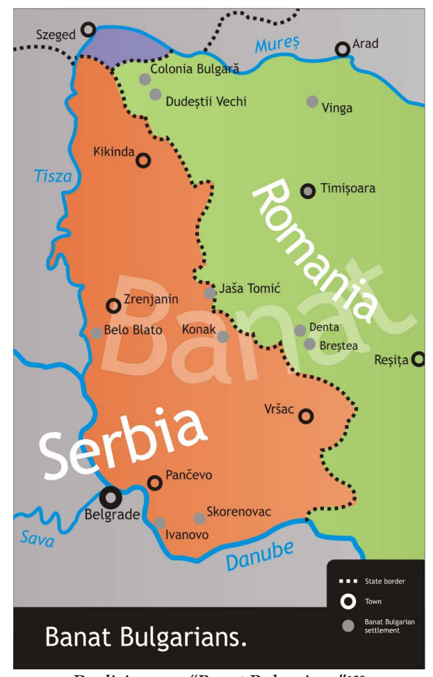
Paulicians, or "Banat Bulgarians" 123

Another diasporic group claimed and lauded by Sofia and Bulgarian scholarship are the "Banat Bulgarians," though its members prefer to be known under the self-appellation of "Paulicians." Their origin dates back to the period of prolonged intermittent warfare between the Habsburgs and the Ottomans, which ravaged and destabilized much of the northern Balkans. Between the late 17th century and the mid-18th century, a trickle of Slavophone Orthodox refugees followed from what today is the northwestern corner of Bulgaria, across the Danube, to the Habsburg lands north of the Danube. Most settled in Banat, which Vienna