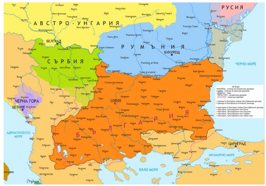
Greater Bulgaria of the 1878 San Stefano Treaty<sup>62</sup>

Bulgaria's bookshops and news kiosks are full of commemorative volumes, periodicals and maps of "Greater Bulgaria" as created by the Russians for the four brief months on the basis of the San Stefano (Yeşilköy) Treaty of 3 March 1878.63 To this day the date is celebrated in Bulgaria with much pomp as the "National Day of Liberation."64 However, already on 13 July 1878, in the Treaty of Berlin, the great powers "shrank" the Bulgarian territory to its present-day size, wary of Russia's growing influence in the Balkans.65 Most Bulgarians see this development as a "national tragedy," and still dream of the national ideal of "San Stefano Bulgaria."66