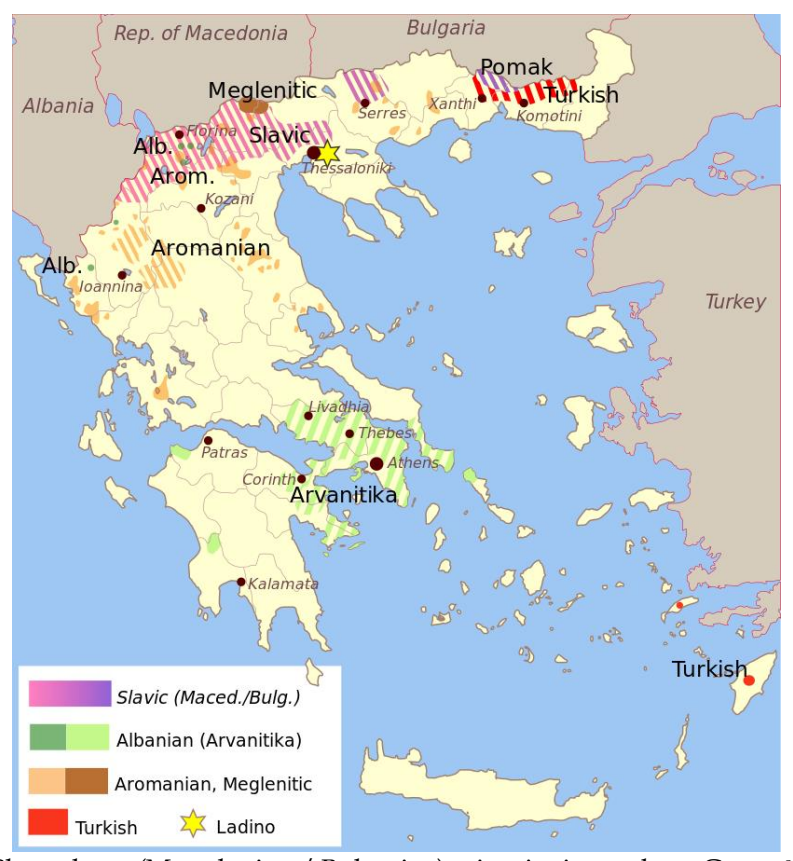
Slavophone (Macedonian / Bulgarian) minority in northern Greece94

But Bulgarian leaders and nationalists are careful not to anger any fellow EU member state. After all Brussels is the main source of funds for the development of Bulgaria,<sup>95</sup> and for lining the pockets of its corrupt politicians.<sup>96</sup> Hence, the ultimatum handed to North Macedonia is a cost-