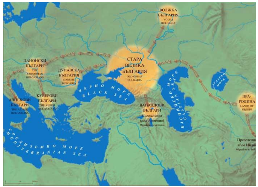
All the Bulgarias of the distant past remade into Sofia's "Bulgarian World" 100

A similarly imperial approach to language politics was practiced in the late Russian Empire. In 1863 the existence of the Ukrainian language was denied and its use in publishing strenuously banned until 1905.<sup>101</sup> Subsequently, a theory was developed that Belarusian and Ukrainian are not languages in their own right, but mere "peasant dialects" of the single imperial (Great) Russian language. Nowadays, this theory has been revived as part of Russia's neo-imperial ideology of the Russkii Mir (Russian World).<sup>102</sup> In turn, this ideology "justifies" the Kremlin's