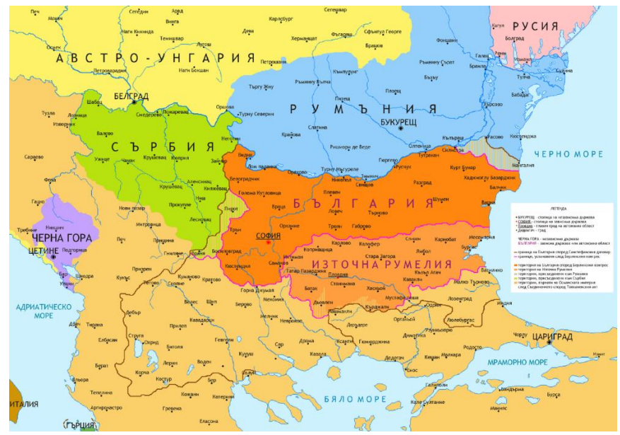
Bulgaria as redefined by the Treaty of Berlin in 187867

During the First Balkan War, Sofia managed to extend the nation-state's boundaries considerably for about two months.<sup>68</sup> Another bout of militarily enabled expansion of the Bulgarian territory lasted for three years from 1915 to 1918 during the Great War. Subsequently, the mirage of "Greater Bulgaria" was lost immediately when the Central Powers collapsed, dragging their ally, Bulgaria, down in the defeat. Obviously, the Entente would not hear about any "San Stefano Bulgaria."<sup>69</sup>