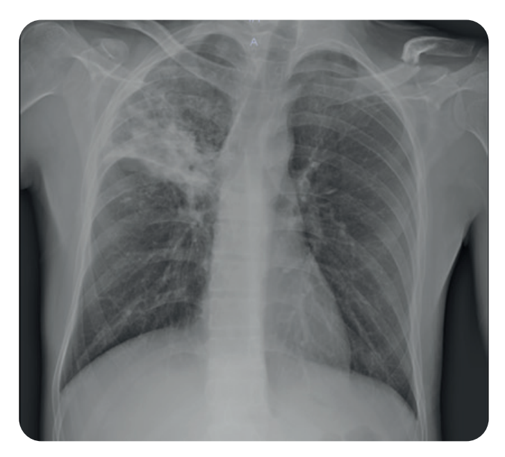
Fig. 1. A heterogeneous density increase in the right upper zone and a fracture in the left clavicle

A 25-year-old male patient was admitted to our hospital complaining of a cough, fever, and fatigue. It was discovered that the patient was involved in a motorbike accident approximately a month ago, which resulted in fractures in his left hand and left shoulder, and that he underwent surgery for the same reason. On respiratory auscultation, rales were heard in the right upper zone. His neurological evaluation also confirmed the existence of flaccid paralysis. Other systematic examinations revealed nothing else out of the ordinary. White blood cell count: 14.200/mm<sup>3</sup>, lymphocyte count: 800/mm<sup>3</sup>, neutrophil count: 12.500/mm<sup>3</sup>, hemoglobin concentration: 11.4 mg/dL, sedimentation rate: 62 mm/hour, and C-reactive protein concentration: 3.19 mg/dL were his laboratory test findings. His liver and