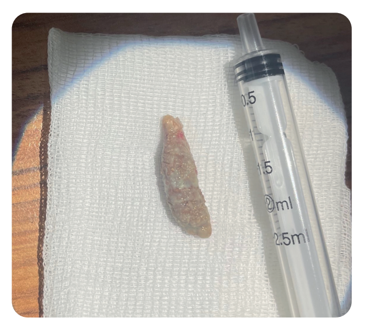
Fig. 2. Macroscopic view of the extracted sialolith