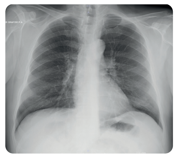
Fig. 3. The aortic ball was visible, the parenchyma was normal

His chest examination were normal, as were the findings of his other systemic exams. His laboratory test results were as follows: white blood cell count 5.800/ mm<sup>3</sup>, neutrophil count 2.900/mm<sup>3</sup>, hemoglobin concentration 13.2 mg/dL, C-reactive protein concentration 0.43 mg/dL, aspartate aminotransferase (AST) concentration 57 U/L, alanine aminotransferase (ALT) concentration 47 U/L, and total bilirubin concentration 1.58 mg/dL. His renal function tests were also normal. The aortic ball was visible on his postero-anterior chest radiography recorded after admission, but the parenchyma was normal (Fig. 3).