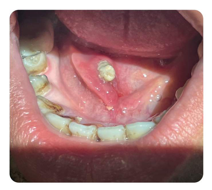
Fig. 1. Sialolith perforating the floor of the mouth on intraoral examination

Under local anesthesia, an incision was made over the canal overlying the sialolith in the mucosa of the floor of the mouth and the elongated sialolith into the canal was removed. The extracted sialolith was 25x7 mm in size. (Fig. 2) In order to investigate the obstruction in the distal from the sialolith for the etiology of sialolithiasis, the right Wharton canal caruncula was found and the examination with a lacrimal probe revealed that the distal canal was obstructed. Intravenous catheter stent placement was performed into the perforated localization of the duct to ensure normal salivary flow and prevent the recurrence of sialolithiasis due to canal obstruction.