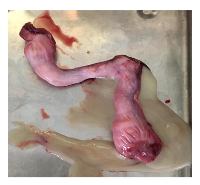
Figure 1. Uterine content after operation

health condition returned to normal. Post-operation controls were made on day 3 and 7 after the operation and at the end of 7th day, stitches were removed.