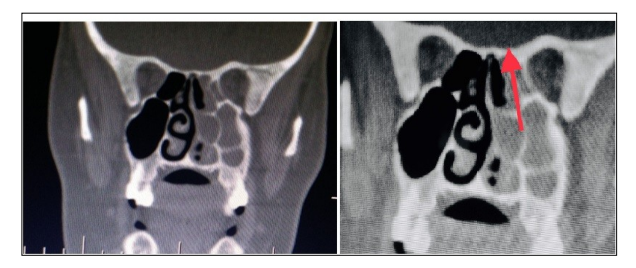
Figure 1. Polypoid mass filling the right intranasal cavity.