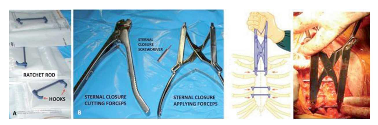
Figure 2. The Sternal Closure Device (SCD) (A) and its ancillary instruments: Sternal closure applying forceps (It is comprised of two jaws that are used to grip the two hooks of the SCD and bring them towards one another along the ratchet rod), sternal closure cutting forceps (It is used to cut off the excess ratchet rod at the base of the movable hook and to cut the middle of the ratchet rod in two in case immediate entry into the chest cavity is indicated), and sternal closure screwdriver (It is used to loosen the screw on the fixed hook in order to remove the device) (B)and a simplified operating technique