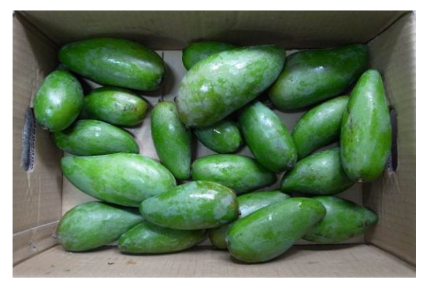
Figure 5. Mangoes (Mangifera indica L.)

used in the experiment. All of the mangoes were stored at 13 °C with 80-90% relative humidity for one week, after which the mangoes were removed from the storage chamber and then analyzed by different quality parameters.