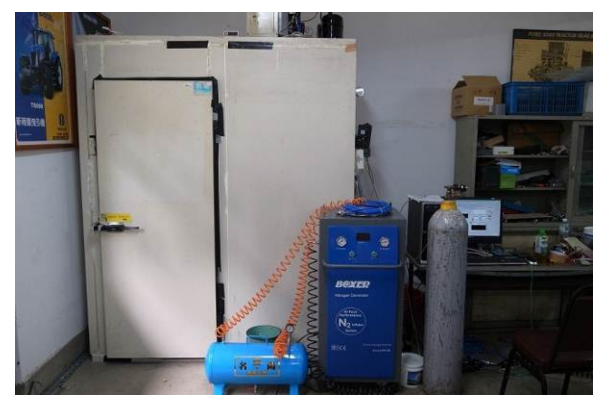
Figure 1. Controlled atmosphere storage chamber

The CA storage chamber (size 180X90X270cm) is shown in Figure 1 was used. Pressurized CO_2 and N_2 gas cylinders with seperate flow meter were used to prepare the desired atmospheres. The gases and air were entered the CA storage chamber. Gas flow rates from the cylinders and air were adjusted by using a solenoid valve system to obtain the required gas concentrations. The excessive gas could be exhausted outside the CA storage chamber to prevent CO_2 accumulation and overpressure. The CO_2 and O_2 concentrations were checked by gas detectors and could also be recorded by a computer.