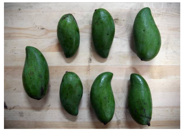
Figure 8. Control set (open air)

Fruits held at 6% O_2 and 4% CO_2 at 13°C showed a higher fruit firmness than the control set as shown in Table 1. Regarding the firmness, mangoes stored in CA represented the excellent results by retaining the maximum firmness as compared to air. The current