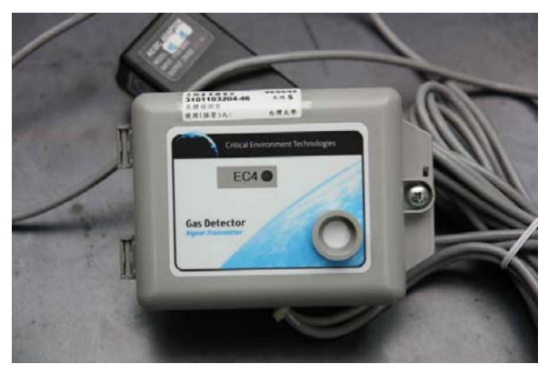
Figure 4. digital signal transmitter for Ethylene (AST-EC4)

Figure 5 shows the mango samples that were purchased directly from the orchard in Pingtung county, Taiwan. The mangoes were packed and transported to the laboratory within 24h after harvesting. Only sound and uniform mangoes were