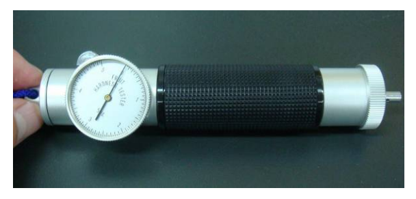
Figure 6. Fruit hardness tester (FHM-5)

Fruit firmness was measured in kilogram (kg) using a fruit hardness tester (Model FHM-5; Takemura Denki Manufacture Co., Tokyo, Japan) after the CA experiment as shown in Figure 6. The level of damage observed in each mango was evaluated from fruit firmness tester. Mangoes were randomly selected for evaluation with a fruit hardness tester. Flesh firmness was measured on the equator of the fruit. This portable fruit hardness tester was equipped with a conical measuring probe (12.3mm diameter).