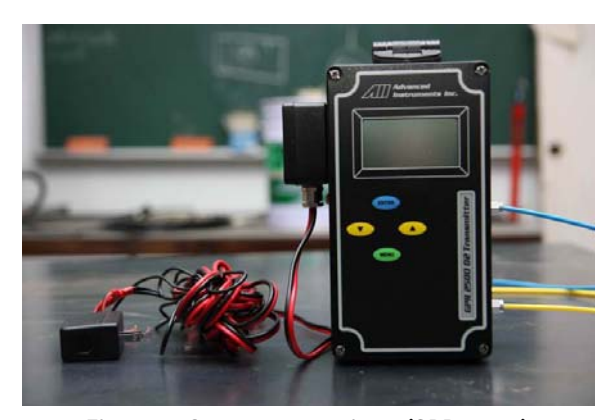
Figure 3. Oxygen transmitter (GPR-2500)