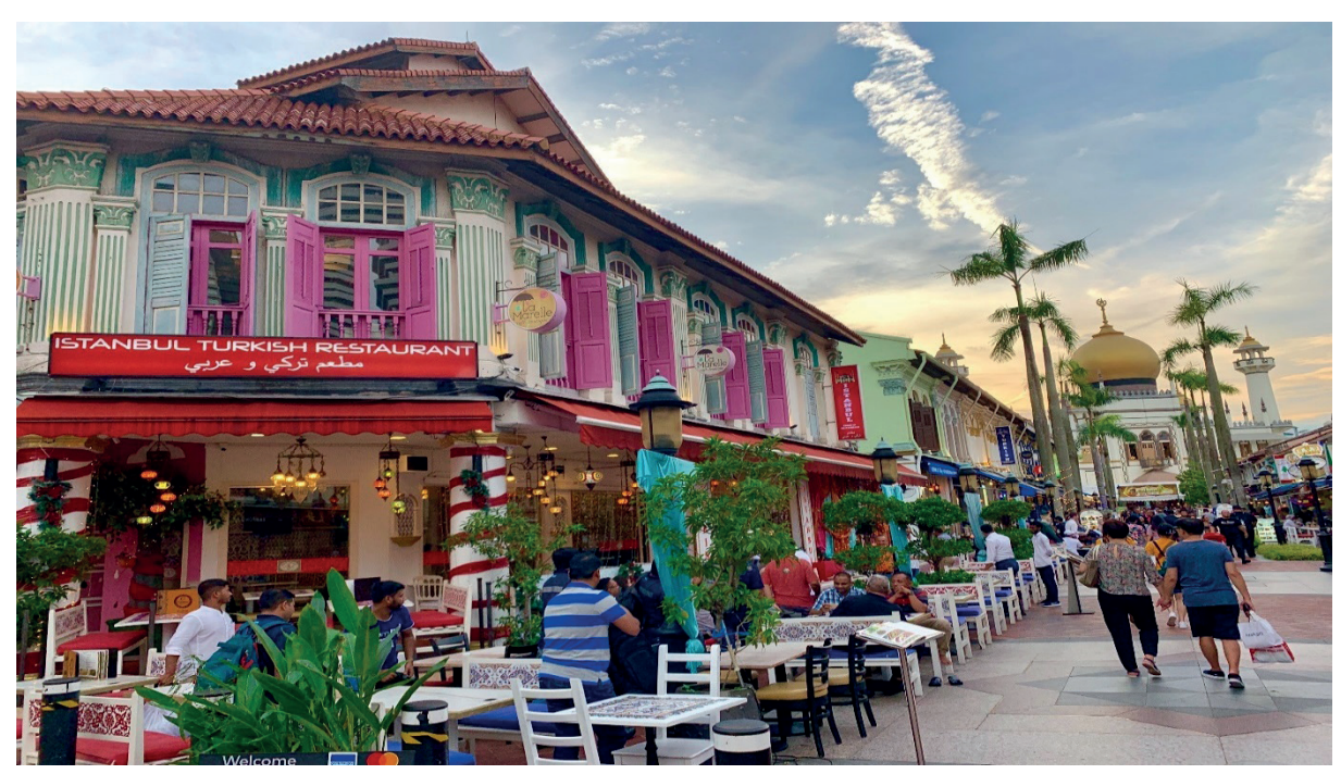
Photo 1: Rehabilitated buildings through conservation in Singapore (Malay-Muslim Quarter).