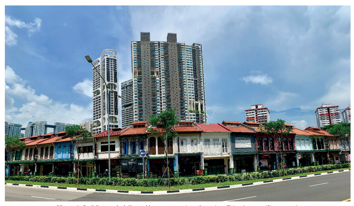
Photo 2: Buildings rehabilitated by conservation along Joo Chiat Avenue (Singapore).

succeeded in protecting their attractiveness by adapting themselves to new economic conditions in relation to tourism, such as recreational activities. Considerable gains have been obtained from tourism and recreational activities as a result of increased value in small and carefully confined locations mostly in the inner-city areas such as Bath, Chester and Norwich in the