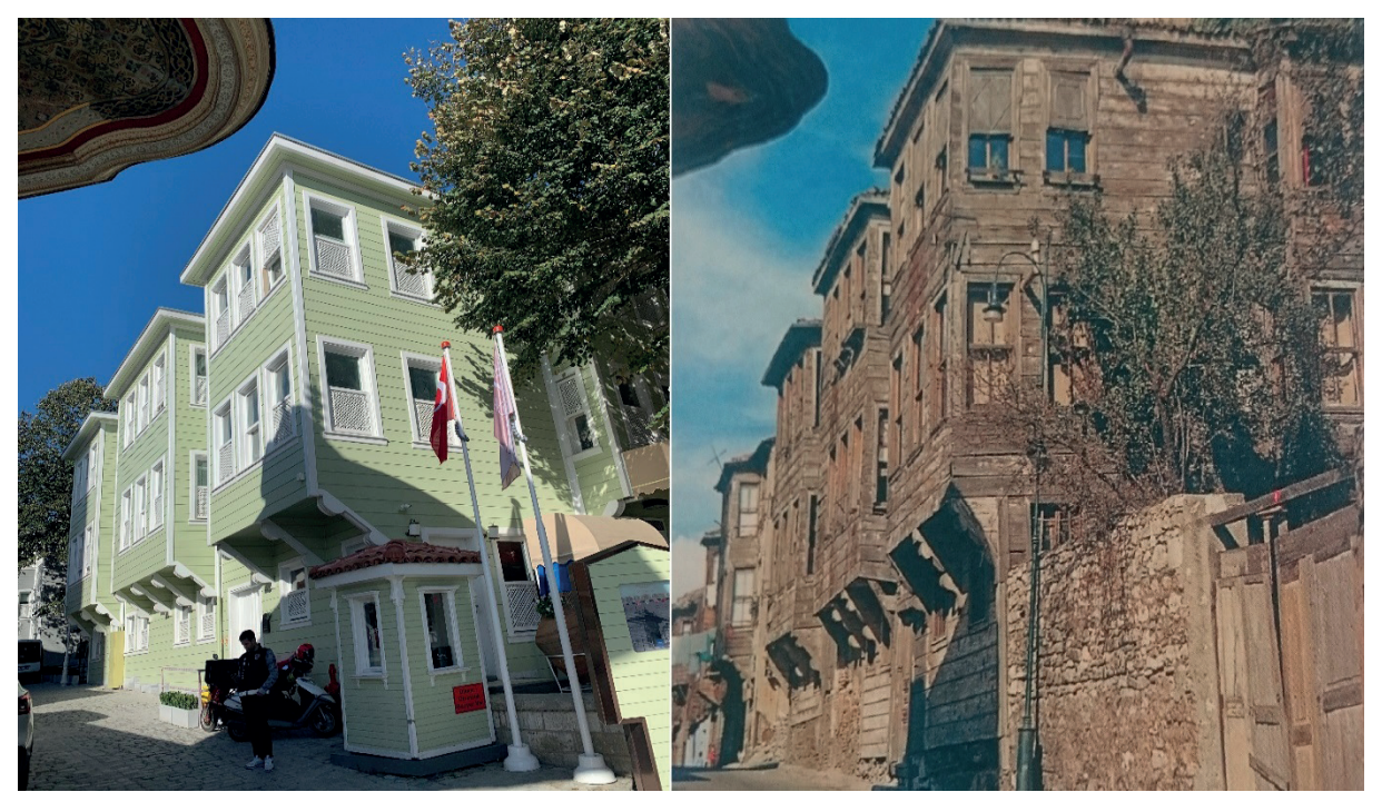
Photo 3: Old and new views of Hagia Sophia Mansions in Soğukçeşme Street, Hagia Sophia.