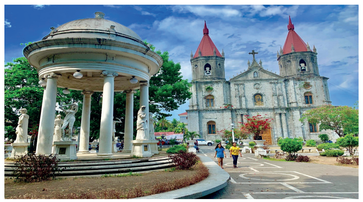
Photo 4: St Anne's Molo Church build with gothic architecture in 1831, Iloilo.

solidarity right (Dadak, 2015). It should be noted that the councils formed long years ago (International Monuments and Sites Council, International Museums Council) and conventions made (Venetian Convention, Convention Concerning Conservation of World Natural and Cultural Heritage) are implemented in line with the economic development of the countries.