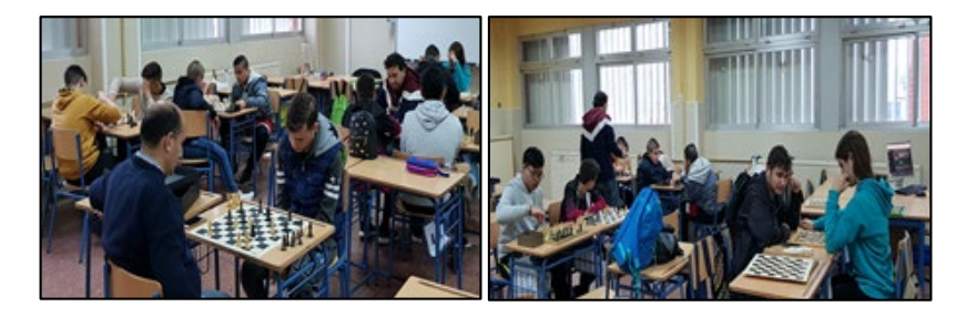
Picture 2. Photographs of the chess club at Torreblanca Secondary School.

In addition, the situations during the game have made it possible to use new words and expressions related to it that have improved linguistic competence in the new language, Spanish. We also consider that the chess sessions have had a positive impact on the development of the logical-mathematical competences, both of the immigrant pupils and of the Spanish ones. In particular we have put special emphasis on the calculation of variants of the game, that is to say, given a determined position the capacity to mentally calculate the possible movements of the opponent and the best possibilities of response.