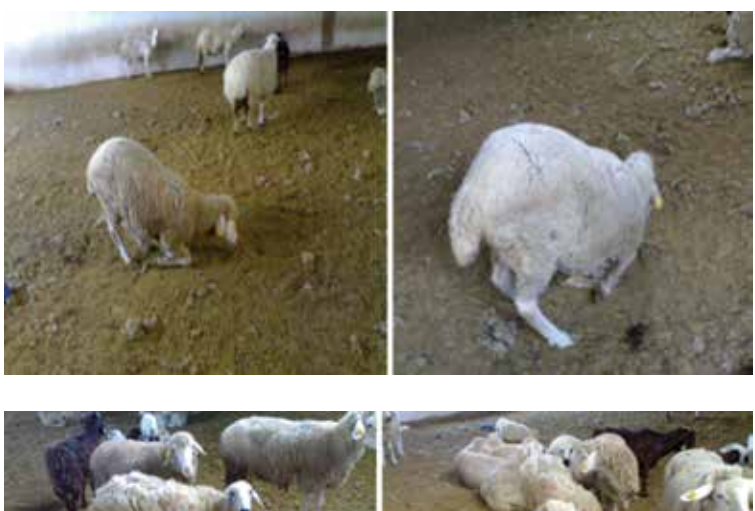
Figure 1. Forelimb lameness a) lateral and b) backwards view in a Merino sheep. Osteoarthricular involvement was evident in Brucella melitensis infected sheep.

Şekil 1. Merinos ırkı bir koyunda ön bacak topallığı a) yandan ve b) arkadan görünüm. Brucella melitensis enfekte koyunda görülen osteoartrikuler tutulum.