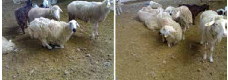
Figure 2. Forelimb lameness in lateral and front view in a White Karaman sheep.

Şekil 1. Merinos ırkı bir koyunda ön bacak topallığı a) yandan ve b) arkadan görünüm. Brucella melitensis enfekte koyunda görülen osteoartrikuler tutulum.