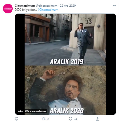
Figure 10: Tweet Posted on December 22, 2020