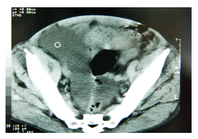
Figure 3. Two months later, control CT scan: Total regression of the hematoma seen before. Note of residual intra-peritoneal effusion.

A control CT scan done after two months showed evident reabsorbtion of the hematoma without complete disappearance (Figure 3). The patient was followed-up for two years and did not manifest any complication or recurrence of his illness. However, he was diagnosed five years later to suffer from leukemia, and passed away shortly after this diagnosis.