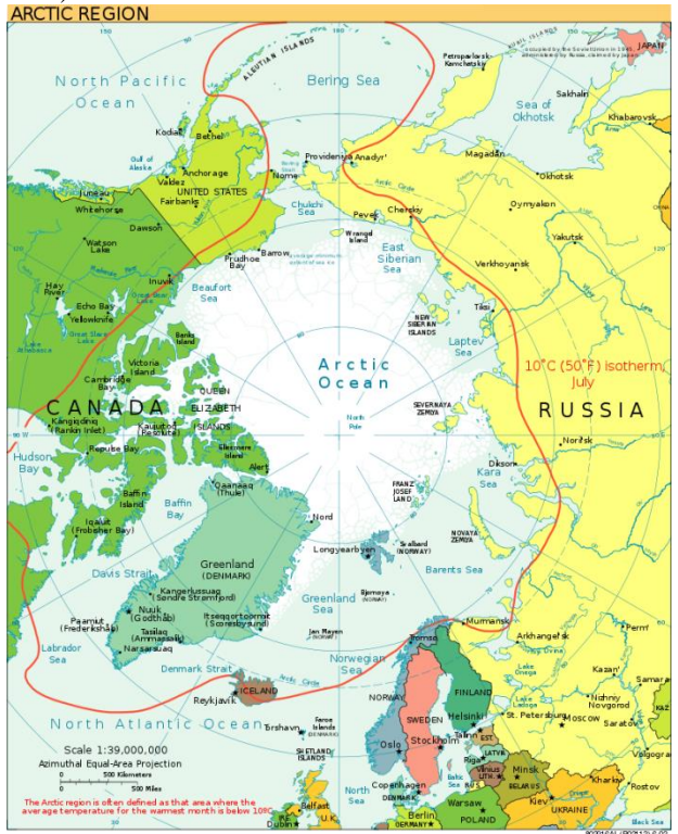
Figure 1. The Arctic Region with Different Definitions (NSIDC, 2021)

lands which surround it are one-of-a-kind (NSIDC, 2021a). It is covered with ice and considered the smallest ocean in the world with an area of 14,090,000 km<sup>2</sup> and five times larger than that of the largest sea, the Mediterranean. It is shallow compared to other oceans and its average depth is 987 meters (Britannica, 2021). These descriptions of the Arctic have also become more attentive regarding the human and political factors that have legislative authority in the region for global politics (AMAP, 1998; Greaves, 2016; Pezard et al., 2018; Togt, 2019).