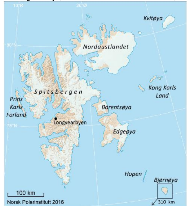
Figure 3. Svalbard Archipelago Map (NPI, 2021)

Its unique geography and easy accessibility for tourists, researchers, and students, research programs, and higher education opportunities in different Arctic disciplines, research stations, and well-organized infrastructures connected to international networks made Svalbard Islands become one of the most important Arctic scientific research areas and tourist destinations (Figure 3). Additionally, in the Global Seed Vault in Longyearbyen, deep inside a mountain and well above sea level, seeds vital to humanity's future are being stored. A very large amount of these seeds from almost one million varieties of food plants are kept in a huge safety depot that houses the world's largest agricultural biodiversity collection. The Global Seed Vault, also called the "doomsday vault", was created for use of humankind in the event of an apocalyptic event or a global disaster (Duggan, 2021). In the year 2020, additional 82,501 seed samples have been safeguarded in the Vault, thus reached 1,074,533 samples in total originating from almost every country in the world, including Turkey (Svalbard Global Seed Vault, 2021).