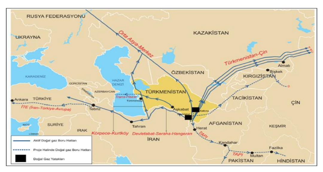
Map 1: Natural Gas Pipelines of Turkmenistan (İsmayilov et al., 2014, p. 34)