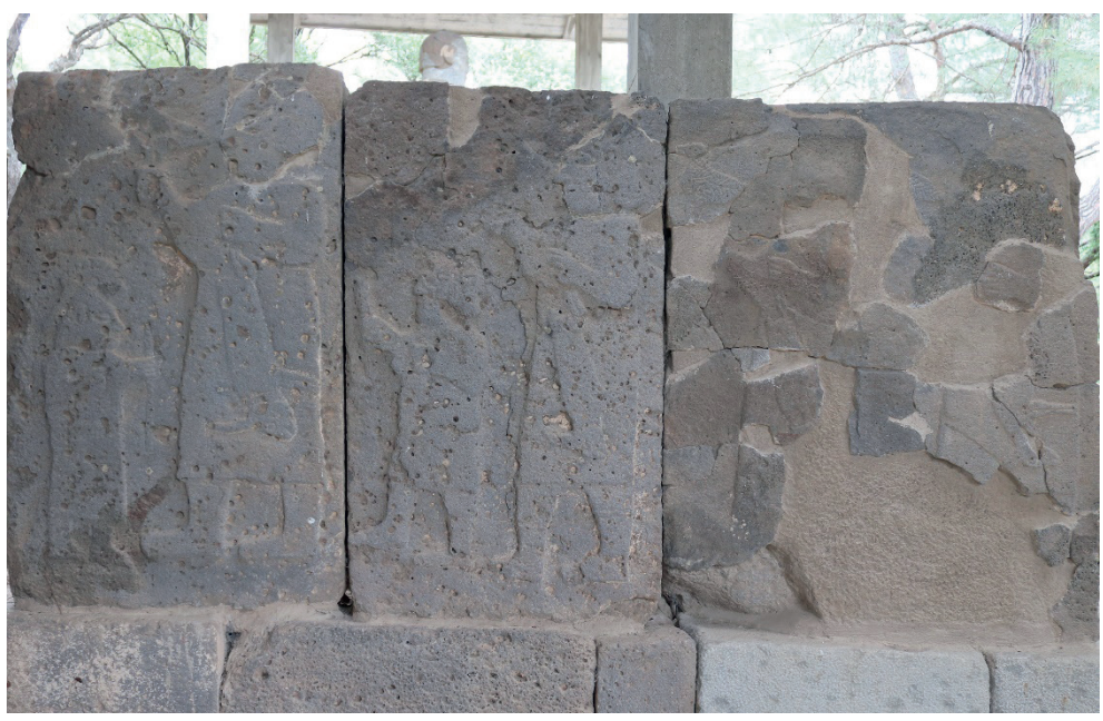
Figure 4. Reliefs of hunting god carrying hare and hawk