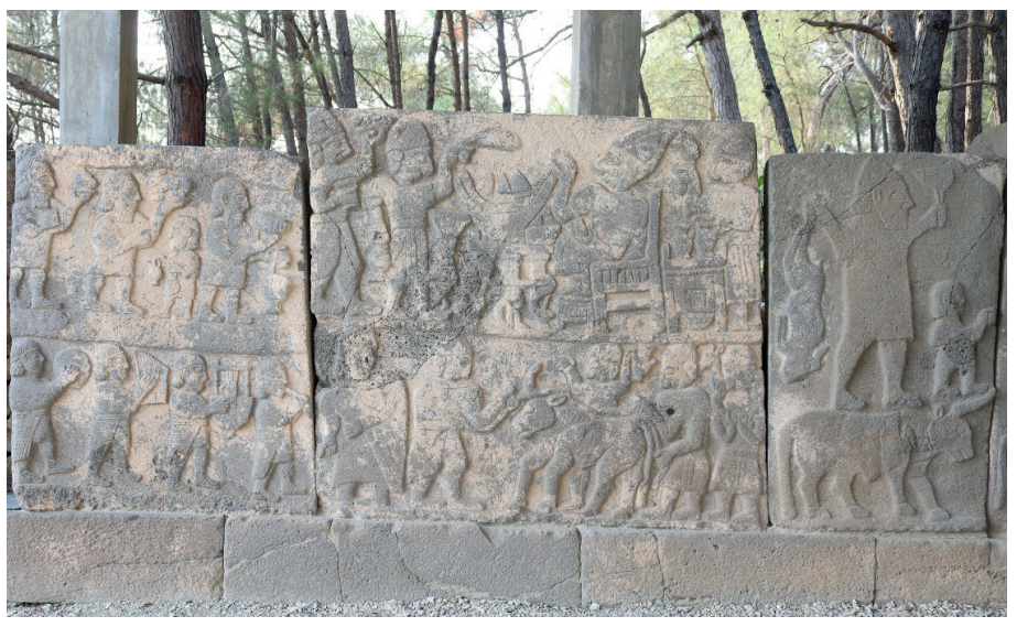
Figure 3. Storm god relief next to the banquet scene