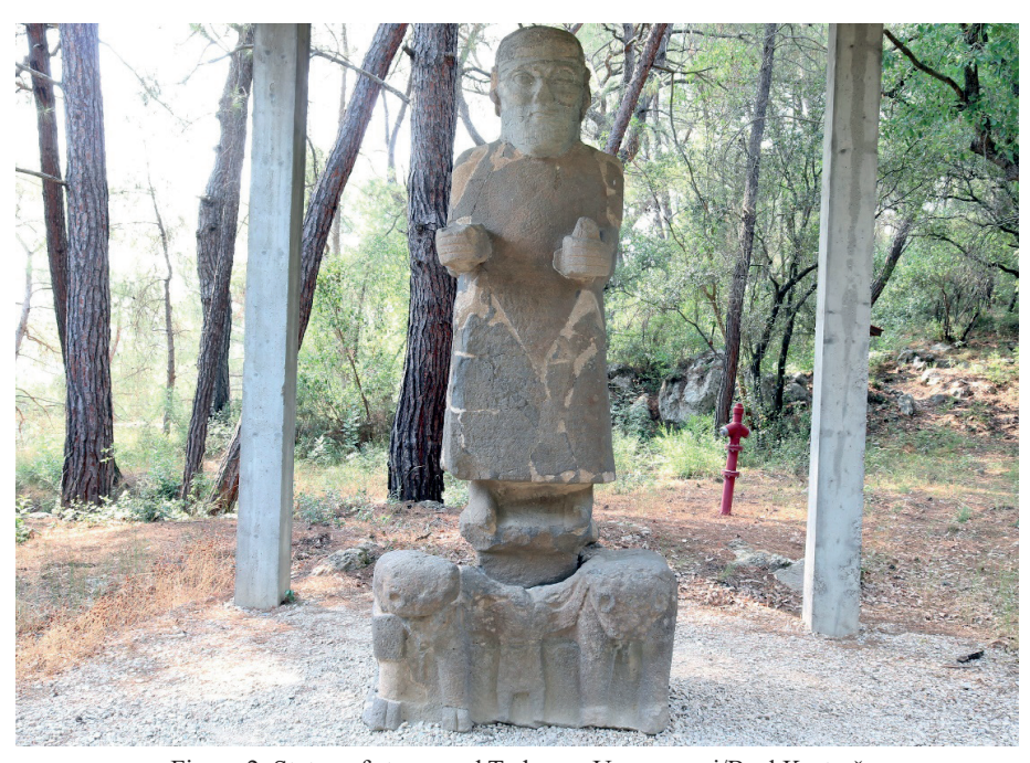
Figure 2. Statue of storm god Tarhunza Usanuwami/Baal Krntryš