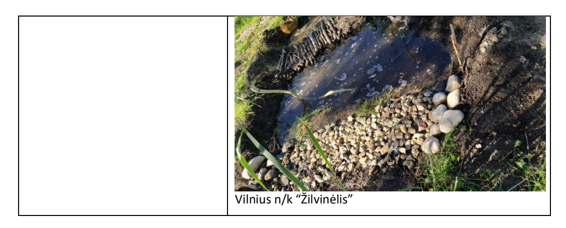
Figure 4. A small swamp as an attractive space for nature cognition

The places with water attract frogs in spring. These animals also bring a lot of joy for children. It is a great discovery for a child to understand how a frog develops or to experience how a tadpole becomes a frog. This is already a new object for observation.