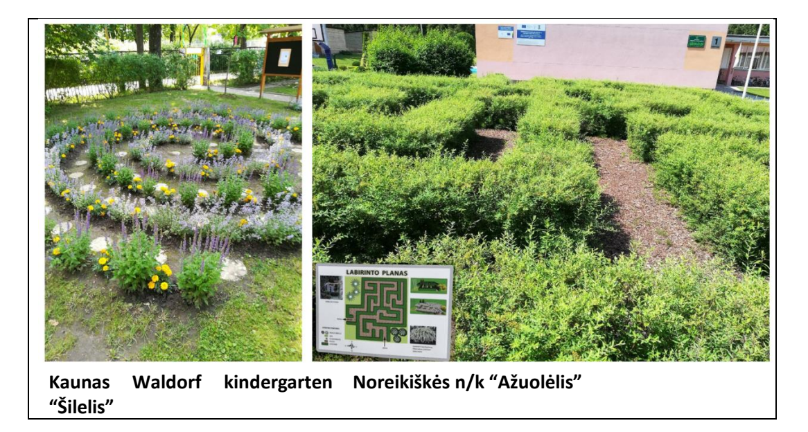
Figure 2. Diversity of plant mazes

If we plant one type of shrub, the maze will be different at different times of the year: it will bloom, the fruit will ripen, and the leaves will change colour in autumn. Children can observe insects that visit plant flowers in the maze, or look for a spider. And when they find it, look through a magnifying glass. When plants bloom in different colours, children learn to cognise the colours. When blooming with flowers of different sizes – the concepts large and small are introduced. Nearby plans should be provided. Children learn to use plans next to the maze. In particular, they help treasure hunters.