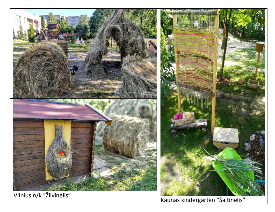
Figure 5. A possibility to better cognise hay and meadow plants

Hay is cut, dried, and collected grass to feed animals, such as goats, sheep and cows. Rabbits and guinea pigs are also fed on hay. Sometimes children from cities do not know what hay is and what it is needed for. Moreover, they are unfamiliar with the mentioned animals. Videos and photos are used for this purpose. Children can play, jump, roll in this area, as well as look for the longest or the shortest dried grass. Children make bouquets from hay, three-dimensional letters, etc. Rolls brought to this space become a place for physical activity (See Figure 5).