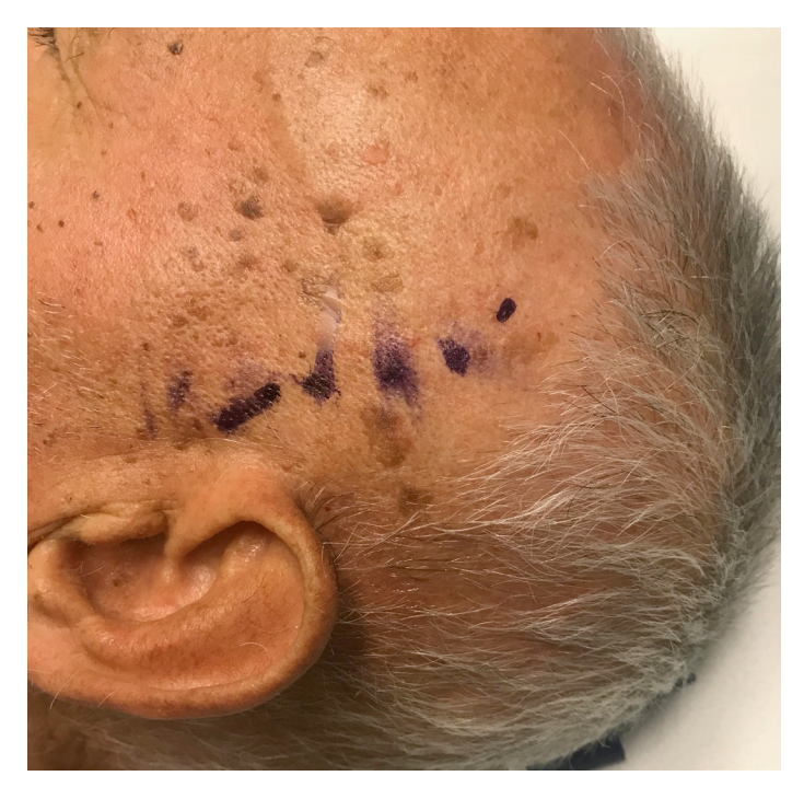
Fig 1: Skin Marking

The surgical procedures were performed under local anesthesia after obtaining written informed consent from all patients who underwent biopsy. A skin incision was created according to the anatomical location of the temporal artery during standard biopsy, whereas the temporal artery was accessed by creating a skin incision according to the identified trace in the ultrasonography-guided biopsy. Approximately 2 cm of artery tissue was obtained in the biopsy. Then, the biopsy samples were placed in 10% formaldehyde solution for pathological examination.