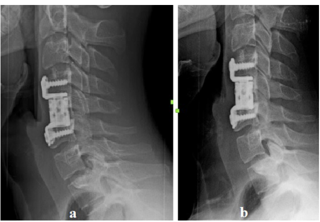
Figure 2. a) Postoperative 1st week and b) Postop 4th year lateral X-ray scan.