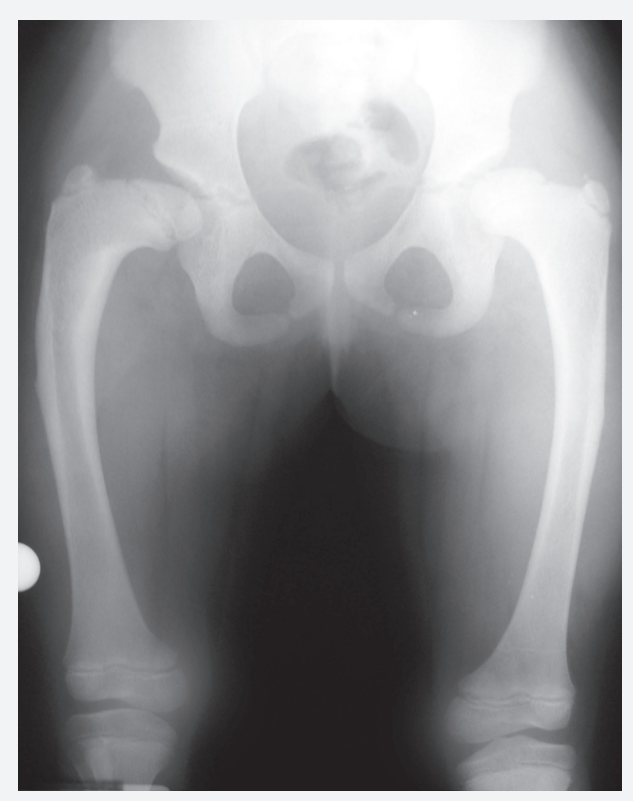
Fig. 1. Radiograph of first case shows; bilateral coxa vara, femoral shortening, deficiency of the femoral lateral condyles, cortical thickening with narrowing of medullary canal, and lateral bowing in the subtrochanteric femoral regions.

Plain radiographs revealed shortness in both femurs, cortical thickening starting from middle of the shaft extending towards trochanteric region, medullary narrowing and severe lateral bowing. Femoral lateral condyles were severely dysplastic. At the connection junction of both tibias at 1/3 medium and 1/3 proximal, there was an indication of bowing towards medial as well as dysplasia in tibial lateral condyles (Fig. 2A, B).