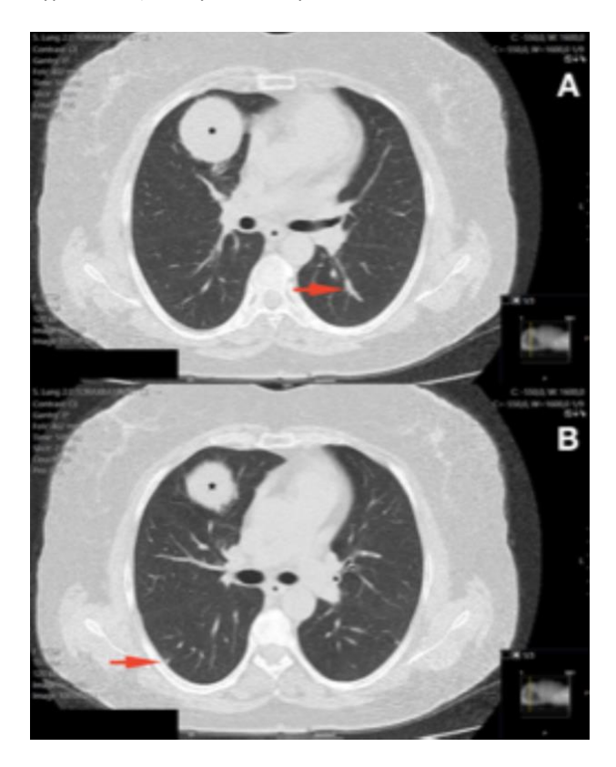
Figure 3. Axial, non-contrast enhanced CT images of the patient (after treatment). Red arrows: Decreased size of oval & round shaped lesions at the lung, Asterisk: Cystic lesion at the liver

In our case, pulmonary hypertension was not developed due to acute treatment after the onset of her symptoms. She was appropriately managed after her presentation and surgical intervention was not required in the followup period.