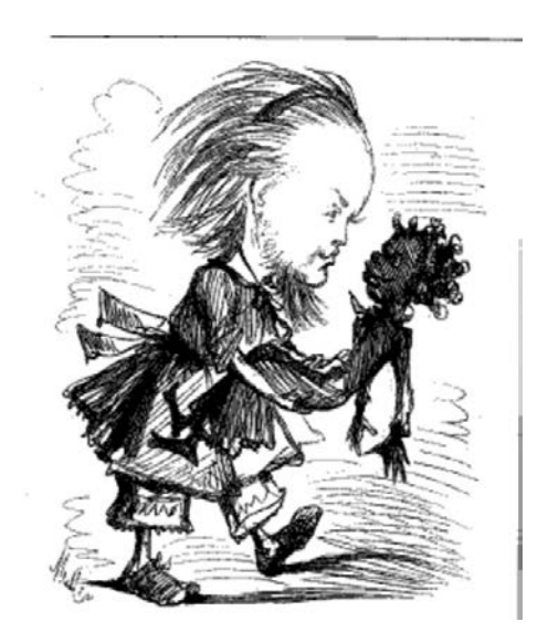
Figure 1 The Approaching Baby Show<sup>1</sup>

Barnum was close to exhibiting a black baby called Abolition in a separate apartment in the museum but the baby was too sickly to be put on spectacle because of being over-fed by nurses. It was also reported that there was an overwhelming attention given to the little baby, so the exhibition had to be cancelled ("Letter from McArone," 1862). This attempt points to the pre-eugenic belief in the inferiority of the black baby which was to be showcased as a curiosity as part of the freak shows. Such display would also serve a purpose to underscore the purity of white babies as opposed to the display of the abnormal black baby. The same article makes reference to how new cargo of goods brought by SS Great Eastern in 1862 would enhance and ease the burden of child-rearing for mothers exemplified through "Baby's Notions consisting of corals in reefs; rattles; ribbons; lace caps; . . . other things of which we do know the names but do not know how to spell them" [alongside with a newly patented baby-jumper which is] "calculated for the reception of twins, triplets, quaterns, quintuplets" ("Letter from McArone," 1862). The article then juxtaposes the foreign nature of the unknown goods with the black baby in a cartoon, presenting two "others," namely the mistrust towards the "foreign" goods embodied and caricaturized stereotypically as an effeminate Chinese immigrant and the stereotypical display of the exotic black baby, in a congruous manner (see fig. 1).