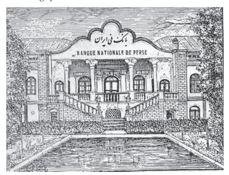
Note. From Bank-e Melli Iran naghashi dar 1307 [Drawing], by Wikipedia, 2008, (https://bit.ly/3ql0gfi). In the public domain.