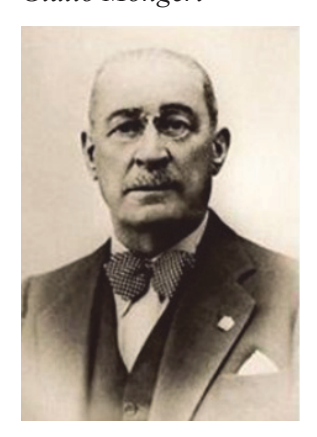
Figure 10 Giulio Mongeri