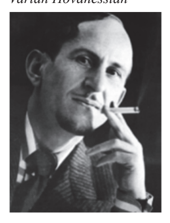
Note. From Vartan Hovanessian [Photograph], by Contemporary Architecture of Iran, 2021, (http://www.caoi.ir/en/projects/ item/636-vartan-hovanesian.html). Copyright 2012 by caoi.ir. In the public domain.