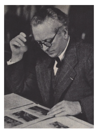
Figure 8 Clemens Holzmeister