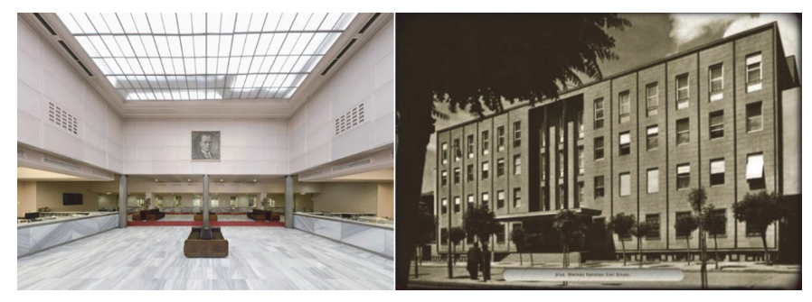
Note. From "Türkiye Cumhuriyeti Merkez Bankası" by Goethe-Institut, 2010 (https://www.goethe.de/ins/tr/ank/prj/urs/geb/ban/zen/trindex. htm) Copyright 2020 by Goethe-Institut. In the public domain. From "Geçmişin modern mimarlığı-8: Ankara-1" by P. Koyuncu, 2010, Arkitera, (https://v3.arkitera.com/h56097-gecmisin-modern-mimarligi---8-ankara-1.html). Copyright 2021 by Arkitera Mimarlık Merkezi. In the public domain.

Left: The interior of Central Bank. Right: The entrance of Turkish Central Bank