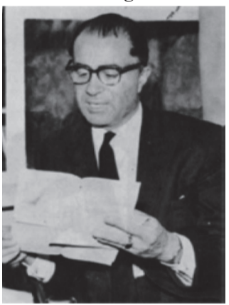
Figure 5 Mohsen Foroughi