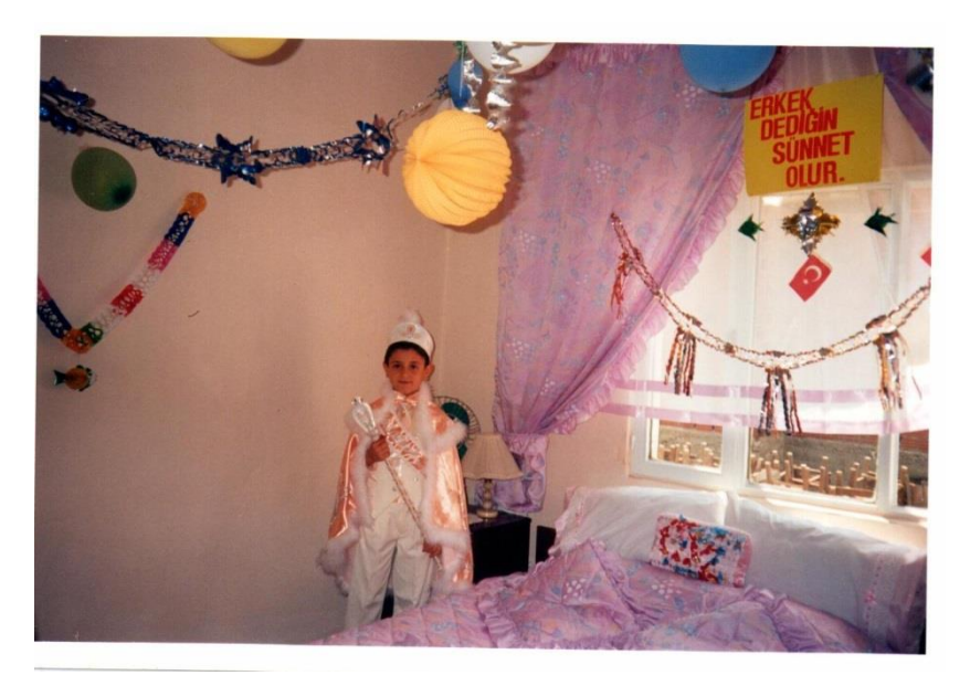
Figure 4: Circumcision bed (Hanged paper means "Real men must be circumcised")

After the preparations in the household are completed, the family members and the close relations start organising the circumcision feast. One day before the day of circumcision feast, the child is dressed in the circumcision costume and taken to a Turkish bath with the children of the relatives and other invited men. After the 'purification' and 'cleaning' ritual, again in the circumcision costume, visits the relatives and kisses the hands of the elderly. If there are any religiously significant places in the city the family inhabits, these places are visited to make wishes and pray for the circumcision to be auspicious.<sup>vi</sup>