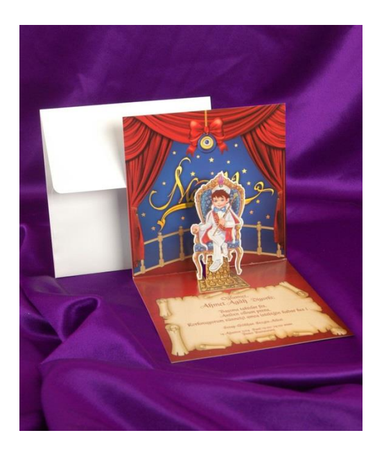
Figure 7: Invitation Card (see <a href="https://www.sedefcards.com">www.sedefcards.com</a>)