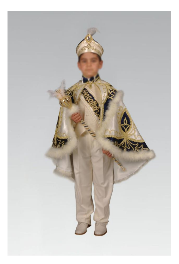
Figure 1: Circumcision dress (see <a href="https://www.sunnetelbisesi.com">www.sunnetelbisesi.com</a>)

for the bed lining and decorations. The house is prepared so that it can host the guests during the circumcision ceremony and the following few days and treats like snacks and beverages are kept available. Among the preparations, the costume of the circumcised child is of significant importance because of the symbolic meanings it has. Particular shopping is done for the circumcision costume in advance. As every piece of the costume has a different meaning and function, details are taken into consideration. A comfortable undershirt is bought and appropriate underwear and pajamas to be worn after the circumcision are chosen. The outer pieces of the costume usually consist of circumcision pants, shirt, a cloak worn over the shirt, and most of the time a hat designed like a tarboosh.