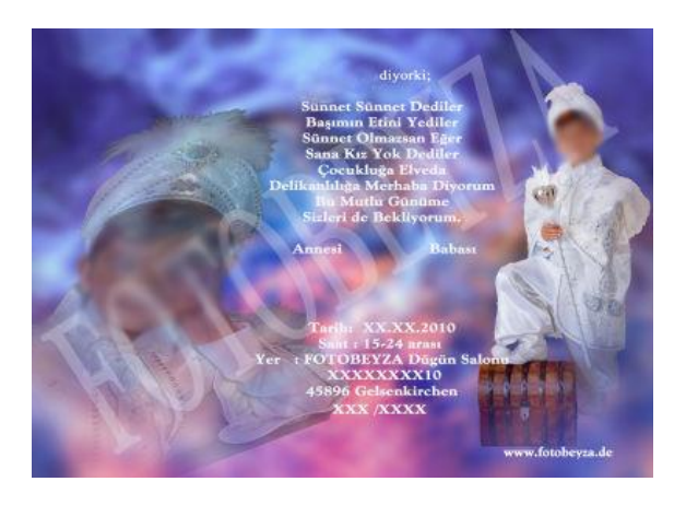
Figure 11: Invitation Card

"They kept saying 'circumcision' and got me fed up. And they said, if no circumcision, no bride, Farewell to childhood, salute to youth, I will be expecting you to my feast"