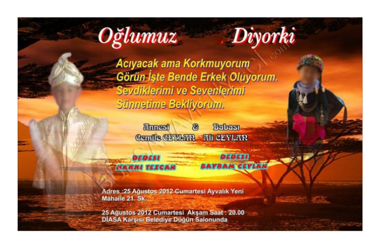
Figure 10: Invitation Card

"On this blissful day our one and only son will take his first step to manhood, we will be honoured to see you, our friends beside us" (see www.bursadavetiyeci.com)