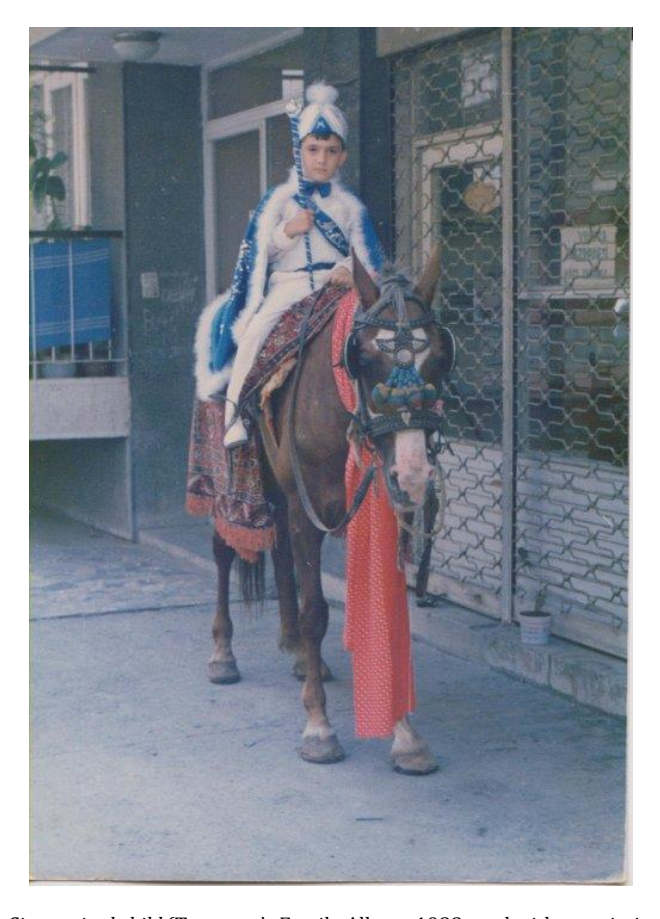
Figure 3: Circumcised child

become the sultan's son! It was beautiful in that sense. Then the bed is made, huge, like a real sultan's bed." (1986, İzmir)