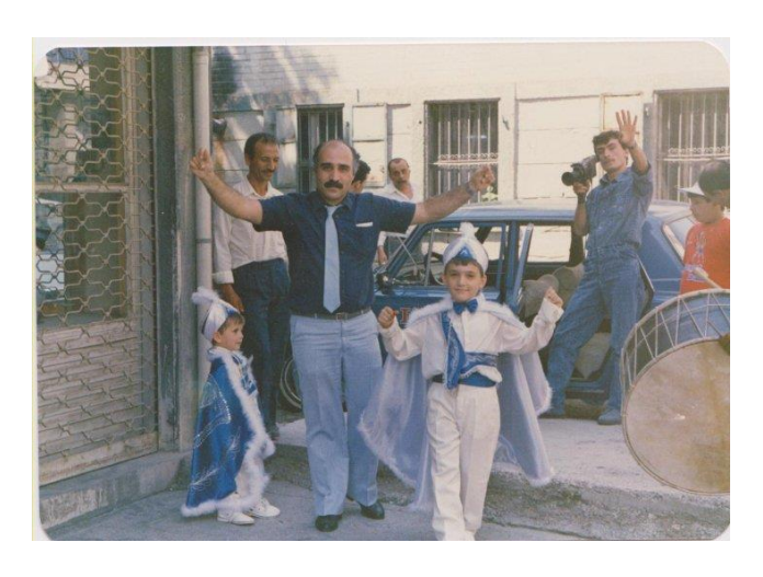
Figure 5: "The Dance of the Father and Son", (Taşıtman's Family Album, 1988 used with permission)