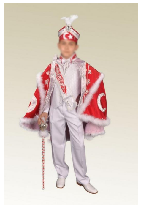
Figure 12-13: Invitation Card (see <a href="https://www.sunnetdavetiyeleri.org">www.sunnetdavetiyeleri.org</a>)