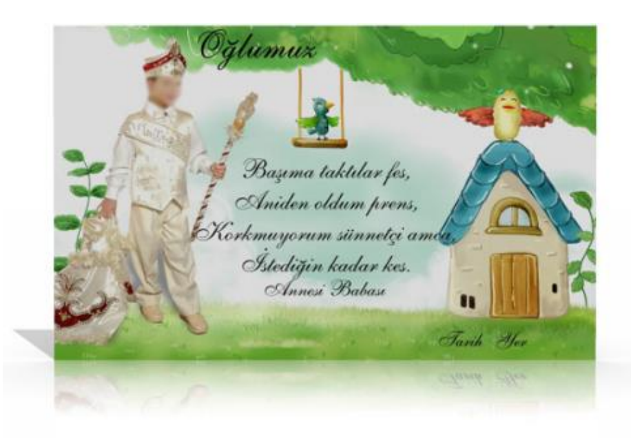
Figure 8: Invitation Card

The idea emphasized in most of the invitation cards is that the boy will become a man from then on. In the majority of the samples there are expressions referring to the necessity of ceremonial circumcision to grow into adolescence, the continuity of the father's lineage, courage and fearlessness. Mostly, a picture of the child in his circumcision costume, holding a scepter in his hand on horseback (like a prince) accompany these expressions.