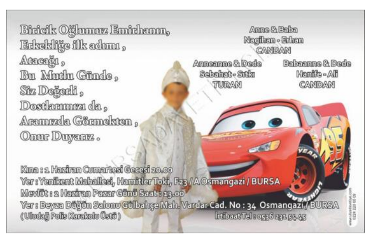
Figure 9: Invitation Card

"On this blissful day our one and only son will take his first step to manhood, we will be honoured to see you, our friends beside us" (see www.bursadavetiyeci.com)