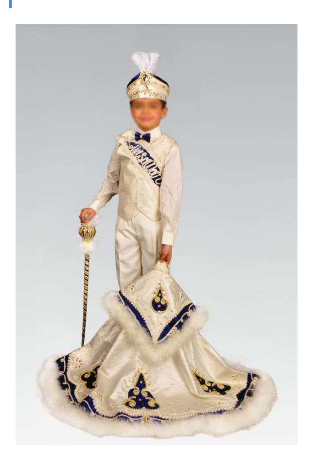
Figure 2: Circumcision dress (see <a href="www.sunnetelbisesi.com">www.sunnetelbisesi.com</a>)

Protection from all evil is wished for the circumcised child with the band saying 'maṣalllah!'iv worn over the circumcision costume and blue beadsv. The hat, the gilded cloak, the scepter which completes the costume turn the male child almost into a king. One of the interviewees expresses what he remembers about the costumes as follows: