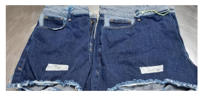
Figure 4. Samples obtained as a result of stone washing (left) and anhydrous enzyme washing (right)

As it can be seen from the samples that are obtained as a result of stone washing and anhydrous enzyme washing shown in Figure 3, the desired stone washing effects could also be obtained with the anhydrous enzyme washing process. Different results have been obtained for different fabric mixtures, and suitable anhydrous enzyme types or combinations can be preferred to achieve the desired effect.