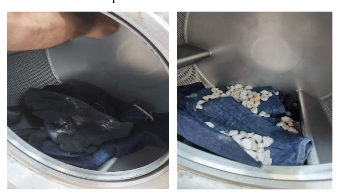
Figure 1. Addition of anhydrous enzyme to wet samples (left), adding pumice stones to the pre-stonewashing process (right)

Tear strength (ASTM D-1424) and pH (ISO 3071) tests were applied to the fabrics obtained as a result of washing processes. While examining the physical effects of the applied processes on the product via performing tear strength, it was examined whether the enzyme treatment performed at certain pH ranges had an effect on the fabric with the pH test.