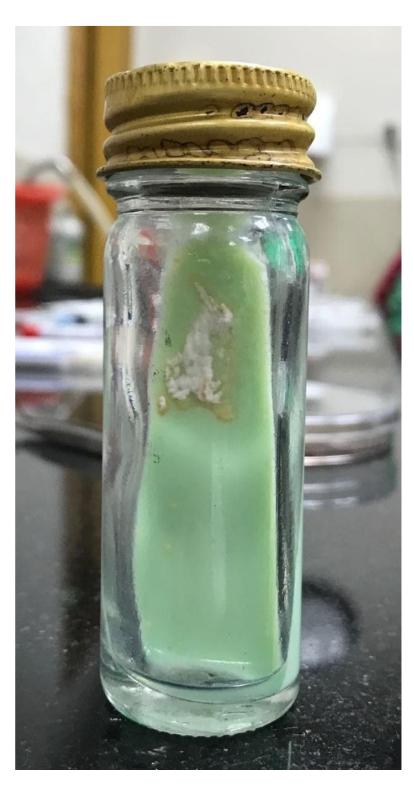
2d. Chalky white colonies growth on LJ medium.