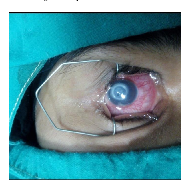
Figure 1. Corneal ulcer with wreath pattern

The infrequent presentation and variable clinical picture of Nocardia corneal ulcers are easily misdiagnosed. This rare entity should be added to clinical differential diagnosis and accurate microbiological examination results in prompt and proper diagnosis. Culture and sensitivity should be the gold standard for diagnosing every corneal ulcer. The direct inoculation of corneal scraping and their direct staining help in early and prompt diagnosis of culprit micro-organisms responsible for the keratitis. Culture and sensitivity are also helpful for choosing proper antibiotics to which the organisms could be responsive to the medical treatment. Meanwhile, antimicrobial stewardship will be achieved by these microbiological analyses.