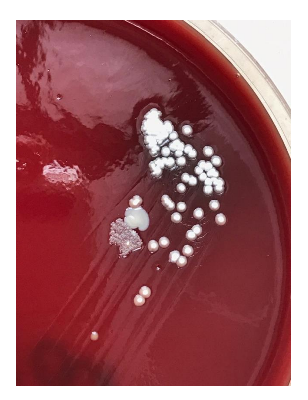
Figure 2a. Chalky white colonies on blood agar.