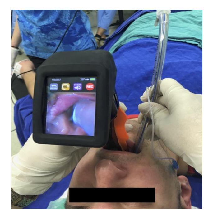
Figure 2. Orotracheal intubation with the naotracheal Airtraq NT combined with a stylet inserted endotracheal tube in Group N

In a letter to the editor, the author used the nasotracheal Airtrag (without channel) with a stylet inserted tracheal tube combination in 42 patients for orotracheal intubation because the standard Airtraq was not available in their hospital at that time.<sup>2</sup> The nasotracheal Airtraq did not have a channel in its original version. Thus, it could be used as a hyperangulated videolaryngoscope the operator would in which manage the videolaryngoscope and the tube separately (Figure 2). Fiberoptic bronchoscopy requires both ongoing education and non-technical skill retention. Finding an easy way to perform fiberoptic bronchoscopy is essential for anesthesiologists. NAP<sub>4</sub> recently demonstrated that anesthesiologists did not want to perform fiberoptic intubation in real difficult airways resulted in death.<sup>3</sup> A recently published study used the combination of the standard Airtrag and fiberoptic on an easy and difficult airway manikin.<sup>4</sup> A new prospective study, that followed an algorithm in the UK in 16,695 patients, demonstrated that tracheal intubation conditions with the standard Airtraq could be facilitated with the combination of a flexible stylet or a fiberoptic bronchoscope in difficult airway patients with a difficult direct laryngoscopy.<sup>5</sup>