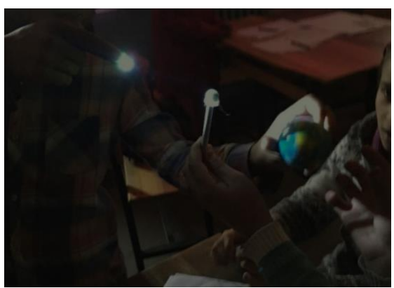
Fig. 3. Students who prepared a solar eclipse model during the explanation phase

Explanation: Groups are allowed to research so they can explain what they've discovered. Students use books and computers in the classroom while doing research. They should be able to make explanatory sentences such as "Solar eclipse occurs when the Moon is between the Earth and the Sun". Designs where the Moon is in the middle and the Sun, Earth and Moon are aligned are considered successful.