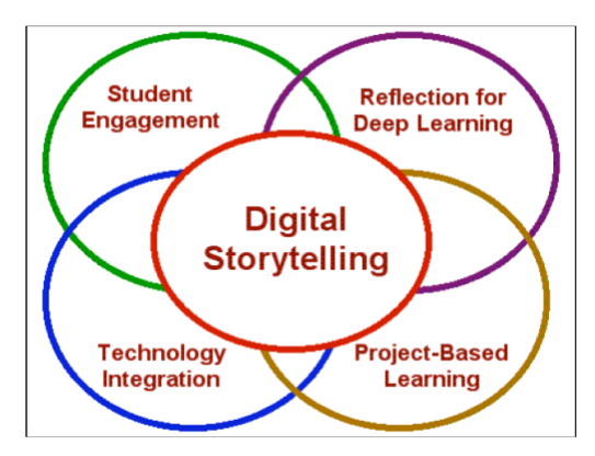
Fig. 1. Student-centered learning strategies convergence (Barrett, 2005)

The digital story method is about researching any subject, writing a script, creating an interesting story, bringing together and recording the story with multimedia tools such as appropriate sound, music, graphics in the computer environment (Robin, 2008). According to Barrett (2005), in the realm of education, digital stories are a synthesis of four student-centered learning strategies: student involvement, reflection for deep learning, technological integration, and project-based learning.