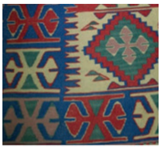
Image 13. Wolf's Mouth Motif Sivrihisar Region (Arslan Kalay, 2015)