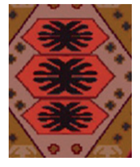
Image 17. Wolf's Mouth Motif Eastern Anatolia Region (Yasubuğa, 2019)