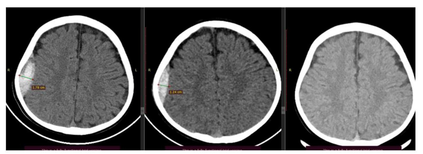
Figure 1: Axial CT scan of a 7-year-old male patient (Patient 14, table 1) shows a right parietal PEDH 18mm in thickness (A). Axial CT scan of the same patient taken 72 hours later shows a little decrease (5 mm) from the earlier scan (B). Axial CT scan of the same patient taken 3 months after discharge demonstrates marked resolution of the EDH (C).

Table 1. Presenting clinical features, management process of 20 patients.