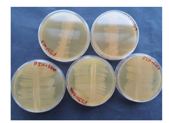
Figure 3. Hyperparasitic activity results (1)

The best results against P. carotovorum subsp. carotovorum (F37, F680, F741, F331, F742) are shown in Figures 3, 4, 5 and Table 3. Inoculated zone values with bacterial bioagent were found to vary between 55.00-11.67 mm. The highest activity was observed between F37 + B60d (55.00 mm) isolate, followed by F680 + B60d (44.00 mm) and F742 + B60d (39.33) isolates. The lowest activity were obtained between F37 + Ç9 (11.67 mm), F741 + Ç9 (13.33 mm) and F331 + Ç9 (16.67 mm) isolates.