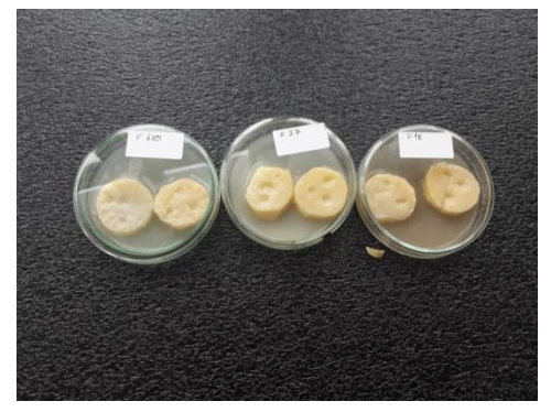
Figure 2. Control