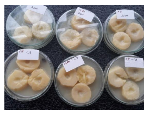
Figure 1. Pectolytic activity