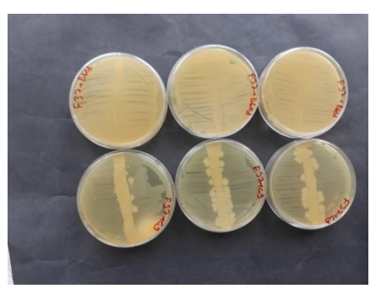
Figure 6. Hyperparasitic activity results (4)