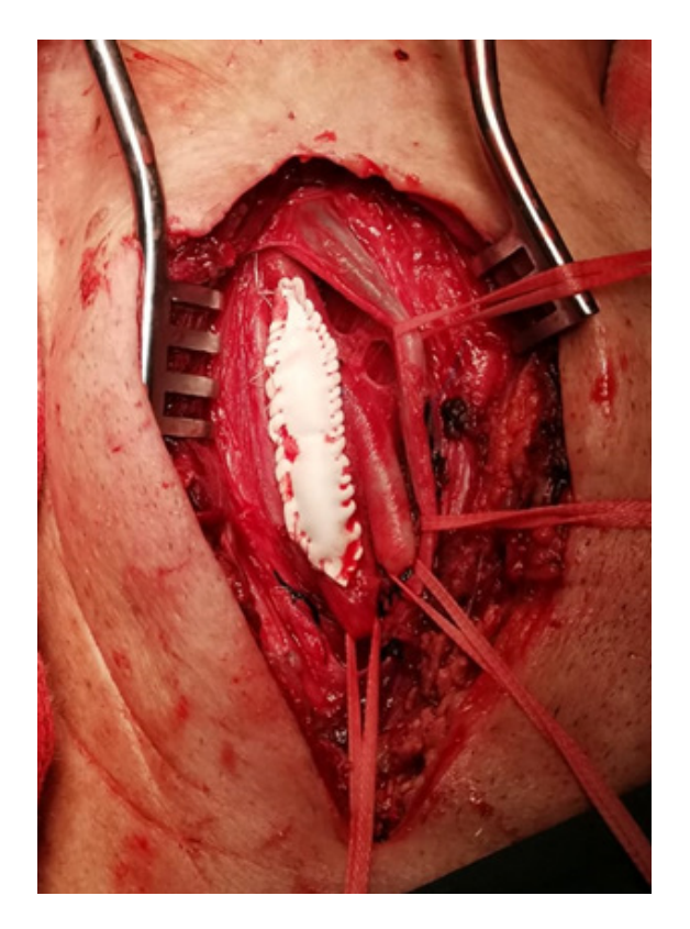
Figure 2. Dacron patch angioplasty closure technique