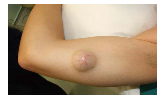
Figure 1: A round lobulated mass in the forearm is evident.

investigation. The MRI showed a large, welldefined, oval, homogeneous mass measuring 3.5x3x2 cm in diameter. The lesion was hypointense on T1- weighted images and hyperintense on T2- weighted images relative to the muscle. The lesion had some low signal intensity foci and serpiginous structures in it on T2-weighted images. After intravenous injection of gadolinium, there was no enhancement of the lesion (Figure 2). The excisional biopsy of the mass was performed under local anesthesia. The gross pathological examination showed that the mass was welldefined, nodular and cystic in nature. The histopathological examination showed that the lumen of the cyst was filled with keratin materials arranged in laminated layers. The wall of the cyst was composed of stratified squamous epithelium with keratohyalin granules (Figure 3). The pathologic diagnosis was keratinous cyst (epidermoid type).