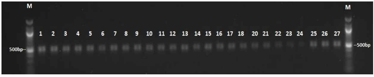
Figure 1. PCR amplification products of Meloidogyne arenaria, M. hapla and M. incognita mtDNA with TRNAH and MRH106 primers. M: 100 bp ladder marker; 557 bp for M. arenaria (Lane 6); 556 bp for M. hapla (Lanes 9-10, 13, 20 and 25-26); 557 bp for M. incognita (Lanes 1-5, 7-8, 11-12, 14-19, 21-24 and 27).

Identification of RKN species were made using the molecular method based on mitochondrial DNA. The polymerase chain reactions amplification with the primers TRNAH/MRH106 produced a single fragment at 556 bp for M. hapla , 557 bp for M. arenaria and M. incognita (Figure 1). A fragment of 214 bp in M. arenaria and 742 bp in M. incognita were produced by PCR amplification using MORF/MTHIS primers whereas M. hapla did not give any fragment (Figure 2). The digestion assay of TRNAH/MRH106 using Hin fl produced 445 and 112 bp fragments for M. arenaria , 446 and 110 bp fragments for M. hapla , and 396, 112 and 49 bp for M. incognita (Figure 3). The Mnl l digestion assay produced a single fragment of 556 bp with M. hapla , three fragments of 340, 140 and 77 bp with M. arenaria , and 340 and 217 bp with M. incognita (Figure 4).