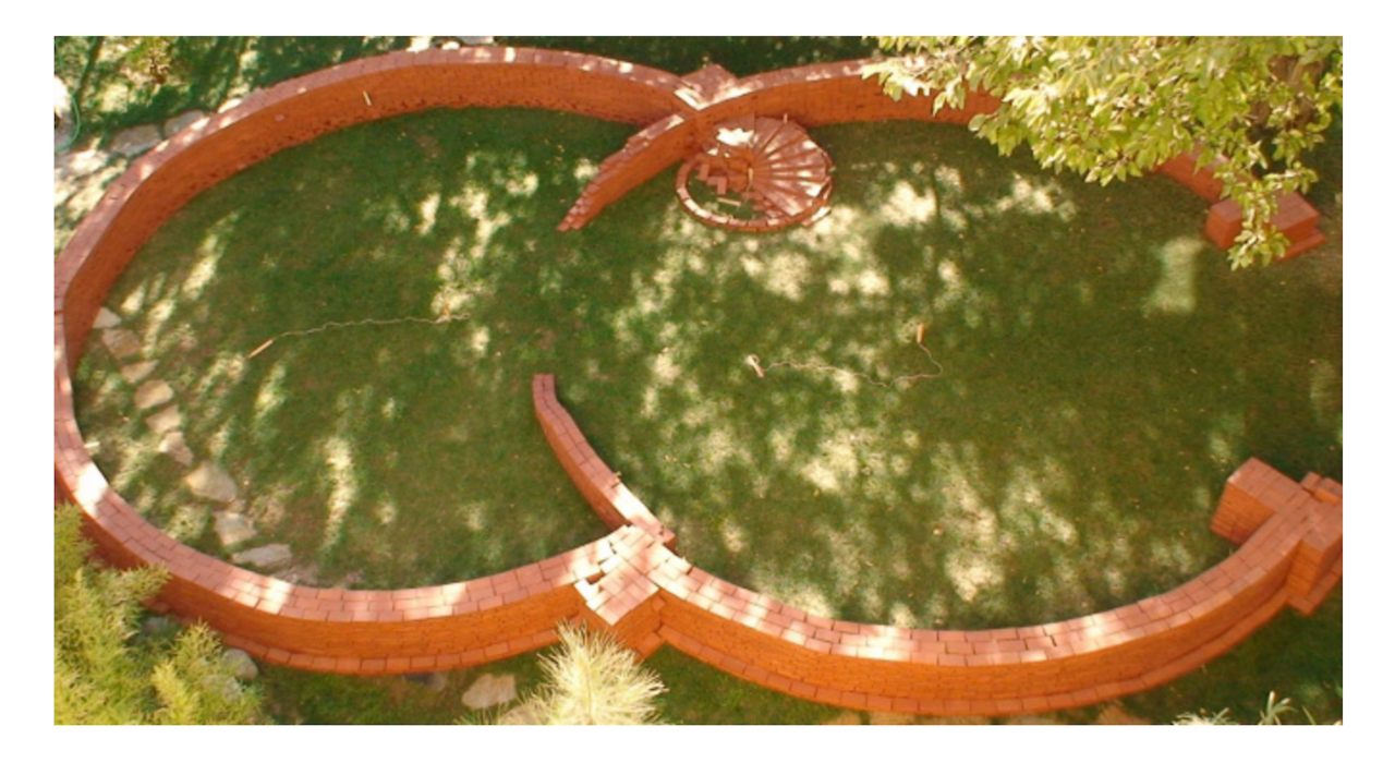
Figure 1. Scale of Melnikov House from Moscow, to Izmir (Moskova'dan İzmir'e Melnikov'un Evi, Ölçek 1), O. Romberg, 2007a.

This exhibition review focuses on the work of the Argentinian artist Osvaldo Romberg (1938-2019), Scale of Melnikov House from Moscow, to Izmir (Moskova'dan İzmir'e Melnikov'un Evi, Ölçek 1) which was exhibited in PORTİZMİR'07 Contemporary Art Festival, Mirage and Desire (07.09.2007-07.10.2007). The curator of this large-scale exhibition was Emmy de Martelaere and the co-curator was Ayşegül Kurtel. As part of Osvaldo Romberg's larger translocation projects which are large-scale architectural installations, in the Scale of Melnikov House from Moscow, to Izmir , Romberg lays the full-scale footprint of Melnikov's home-studio, in the French Cultural Center in İzmir (Figure 1 and Figure 2). As stated in his website: "Through this technique of translocation, Romberg raises the questions of geography, erasure, heritage, echoes, ellipses" (Romberg, 2009). The artist also integrates a text from the book the Aleph by Jorge Luis Borges (Figure 4).