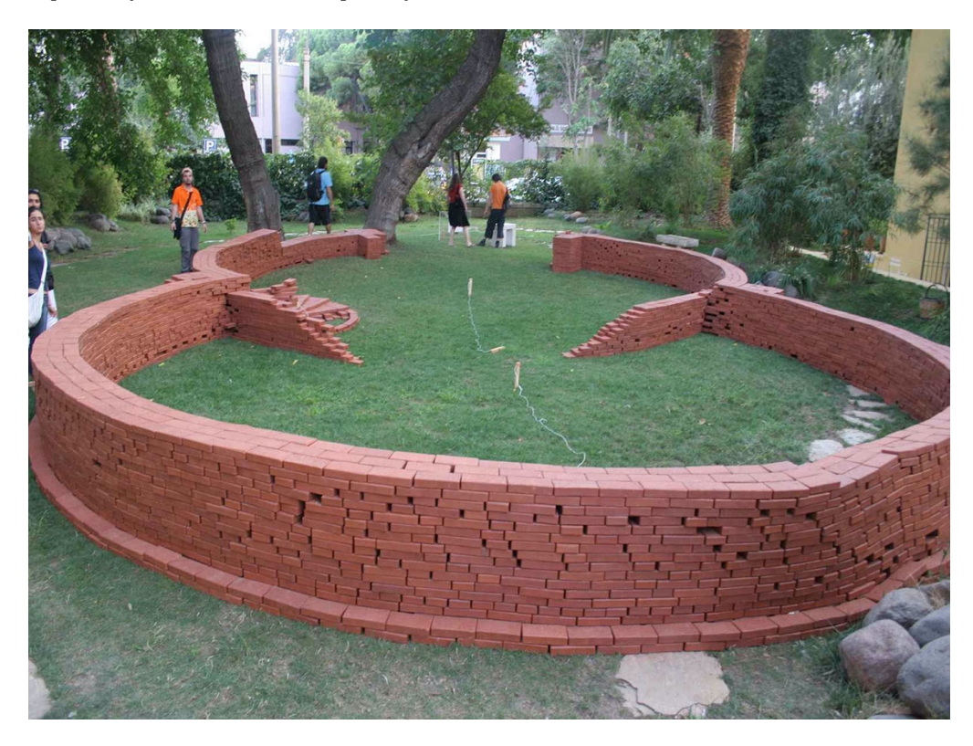
Figure 2. Scale of Melnikov House from Moscow, to Izmir, (Moskova'dan İzmir'e Melnikov'un Evi, Ölçek 1), O. Romberg, 2007 (S. Aka kişisel arşivi, 2007).

surface of contact and greater volume compared to a cube." (Martínez Otalora et al, 2020, p. 390). In other words, one could fit in a larger volume in a cylinder than in a cube: "...the cylinder is more compact than the cube and this difference decreases the amount of material used for the construction." (Martínez Otalora et al., 2020, s. 390). In addition to the decreased amount of material necessary for the building's construction, the building's shape was designed to prevent heat losses and optimized the conditions for the winter period (Otalora, et al, 2020, p. 391).