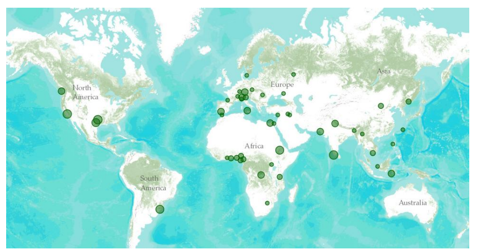
Figure 2: Map of Type-B State-Seeking Nationalist Movements

When there is at least one nationalist organization claiming or demanding separate statehood but level of mobilization is low, we called these movements Type-B movements. In reference to Miroslav Hroch's terminology, it can be argued that these movements are in their "patriotic agitation" phase and they have not yet become a serious threat for the states against which they organize. We categorized 48 of the stateless nations (27.5%) as Type-B movements. Interestingly Type-B movements can also be observed in places where Type-C movements did not exist. For instance in North America Type-B movements are more common than the type-C movements. The Californian, Texas and Southern nationalist movement is a Type-B movement in Canada. Emerging Lombardian, Ligurian and Venetian nationalisms in North Italy, and Sicilian nationalism in Southern Italy can be seen as examples of Type-B movements in Central Europe.