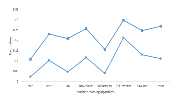
Figure 3.Variation of error rate based on the machine learning algorithms