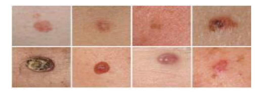
Figure 1. Sample of dataset