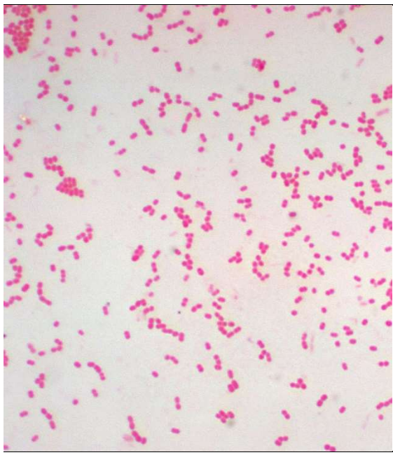
Figure 3: Microscopic examination of a Gram-stained smear revealed small Gram-negative coccobacilli.

This is an entirely perspicacious scenario where he was diagnosed with A. junii infection in urine culture with no underlying renal pathology and long-term use of antimicrobial drugs or malignancy.