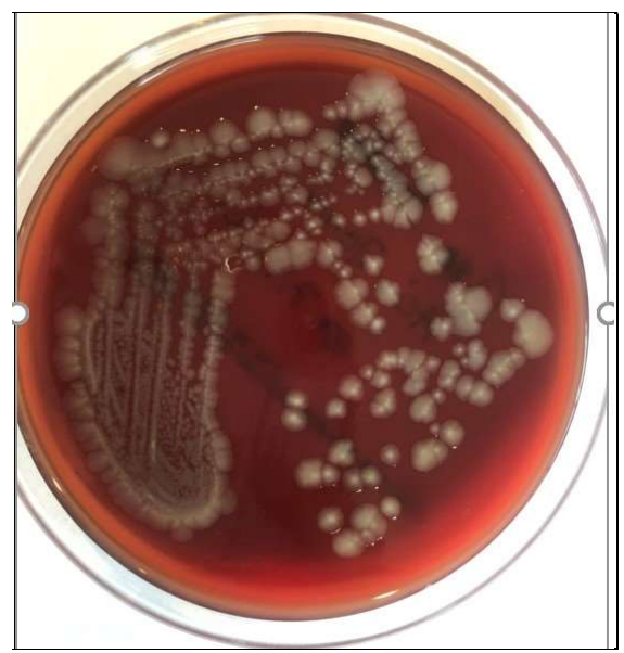
Figure 1. Non-hemolytic opaque round colonies on sheep blood agar.

tobramycin, and neomycin), Fluoroquinolones, tetracycline, Cephalosporin's, norfloxacin and sulphonamides.