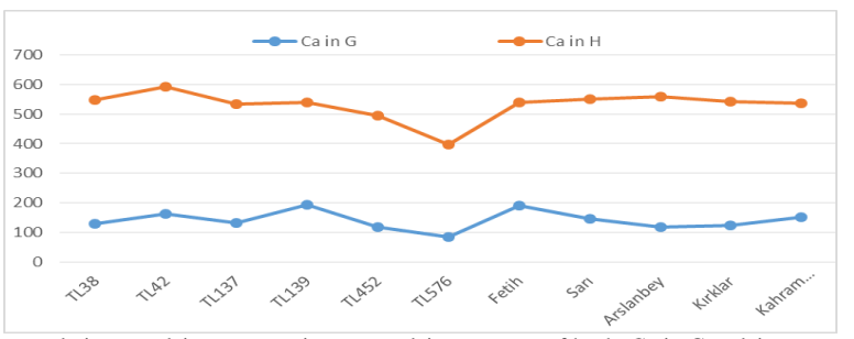
Figure 3. Graph of oat genotypes relative to calcium content in groat, calcium content of husk. Ca in G; calcium content in groat, Ca in H; calcium content of husk

** significant at 0.01 level, C.V. Coefficient of Variation.