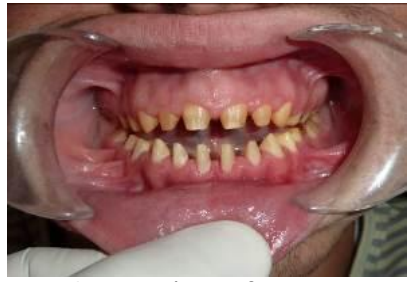
Figure 3. Intraoral view after preparation of the teeth.