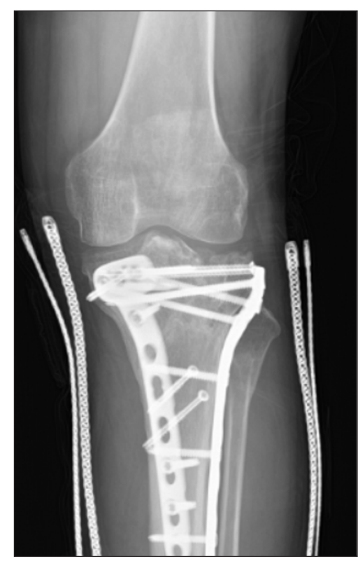
Figure 5. Bilateral approach dual plate x-ray

Pain was assessed on a visual analogue scale (VAS) ranging from 0 to 10 cm. The VAS was performed in two sections. In the first section we asked the patients to score their pain near the fracture site during Daily activity. Anterior group VAS 2,83 (1-7) 1 patient marked who is go on revision 7, Bilateral group 3,35 (1-7), 3 patients marked 7 whose were operating more than one and still unstable knee motion.