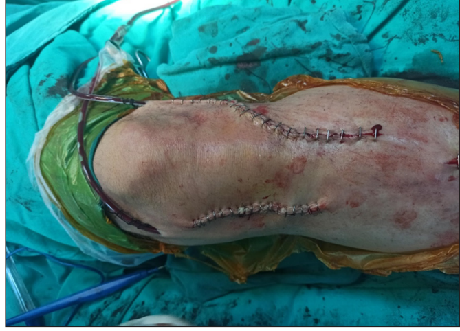
Figure 4. Bilateral incision; anterolateral and medial for dual plating

In the Anterolateral and Posteromedial approaches, the patients were placed in the supine position by applying a tourniquet to the extremity to be operated under spinal/epidural anesthesia. The knee was supported under approximately 75 degrees of flexion, and the subcutaneous tissues were lifted up to the fascia in the form of a flap by entering through the anterolateral and posteromedial incisions. The fascia was opened and the muscles were lifted subperiosteally from the bone. The joint capsule was opened, and the menisci were released from the places where they were attached to the tibia and the inside of the joint was visualized. The steps in the joint were corrected and supported with grafts and fixed with plates under the control of scopy ( Figure 4 ).