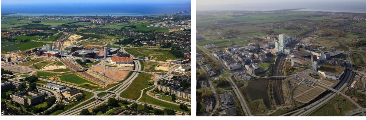
Figure 5. Hyllie in 2022