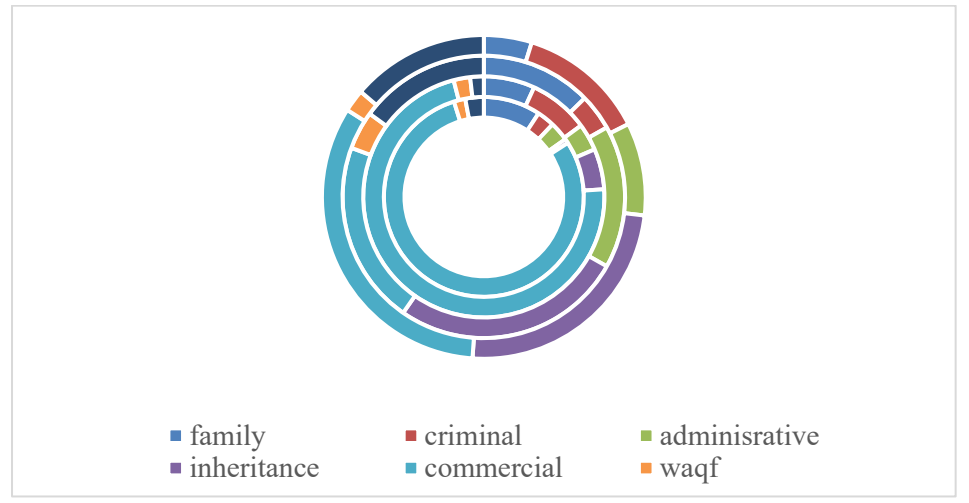
Figure 3: Case type Distribution by Courts (From inside to outside Galata, Üsküdar, Konya, and Kütahya)

The court records do not specify the case types explicitly. So, observations are categorized into seven categories according to case content: family, criminal, administrative, inheritance, commercial, charitable foundations (waqf), and others that cannot fit into any of these categories. Figure 3 shows how records are distributed according to the case types across courts. We can see that in each region case types distribution of courts resembles each other. This is one of the bases that we analyze the courts together as regions. Two circles inside of the figure, namely Galata and Üsküdar have many commercial (79%-72%) and some family cases (9%-7%). Üsküdar has proportionately more criminal (8%) and inheritance (4%) cases compared to Galata (3%-3%). However, inheritance and administrative cases are more common in Konya (40%) and Kütahya (33%) courts. The commercial cases ratio drops to 21% in Konya and 33% in Kütahya.