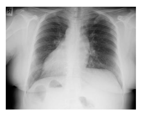
Figure 1. X-ray image of right-sided heart in patient with SIT

As described by the literature examples above, LC in a patient with SIT is a challenging operation. In addition to adhesions caused by inflammation, there is a higher risk of serious injuries due to the reversed positioning of organs and frequent anatomical variations in the bile ducts in patients with SIT.<sup>2,6</sup> However, for surgeons who use both hands dominantly, a successful operation can be performed with proper knowledge of anatomy, maximum compliance with the defined rules for surgical operations, mastery of laparoscopy, and careful dissection, despite the anatomical difficulties posed by SIT. 6,9,10 In this case report, despite the technical challenges faced by the surgical team compared to the normal LC performed on the right-sided gallbladder, a LC operation was successfully performed by a surgeon with dominant use of both hands and experienced in laparoscopic surgeries. The patient was discharged in a healthy condition after a complication-free operation.